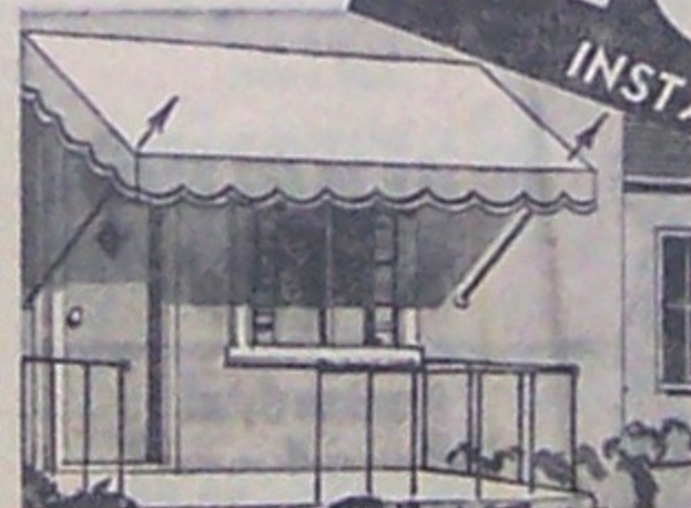
Magic-Lite Canopies Blend with Any Interior