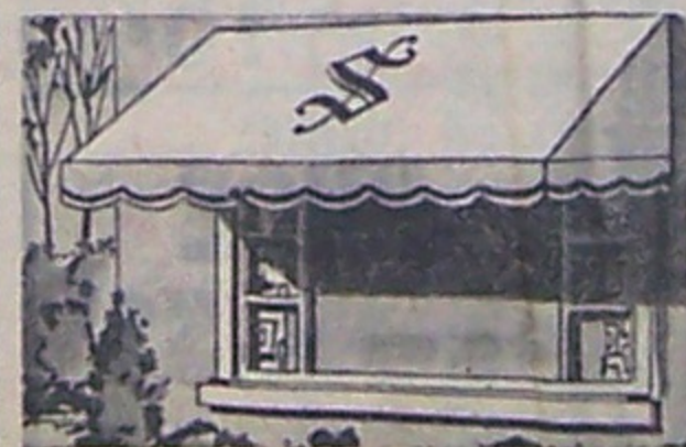
One of the Many Attractive Magic-Lite Awning Styles

COMPLETE WITH ALL HARDWARE $16.95 INSTALLED