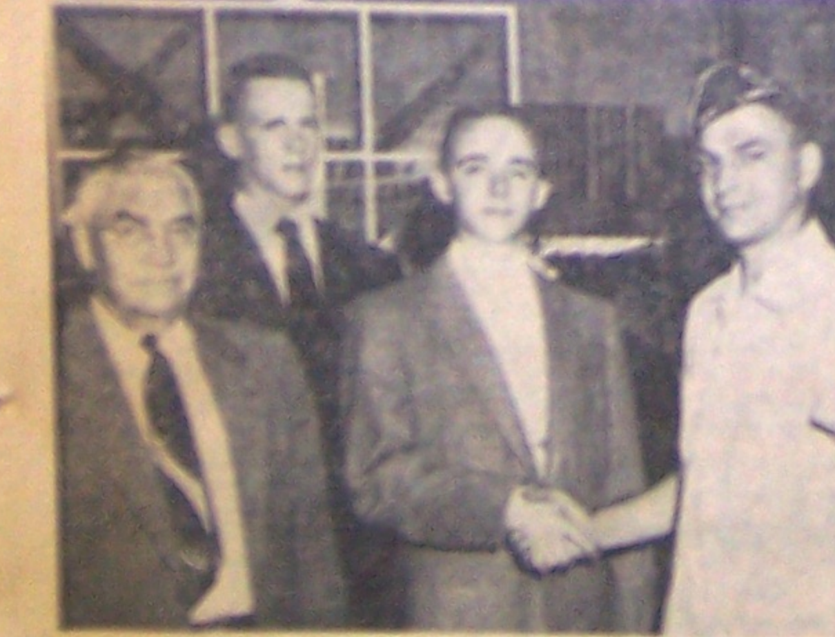
Group photo of the winners of the Boy's State awards, including boys and officials.