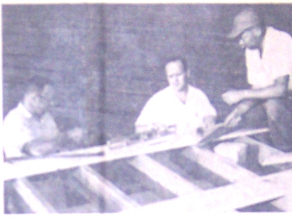
Lions Little League Stadium