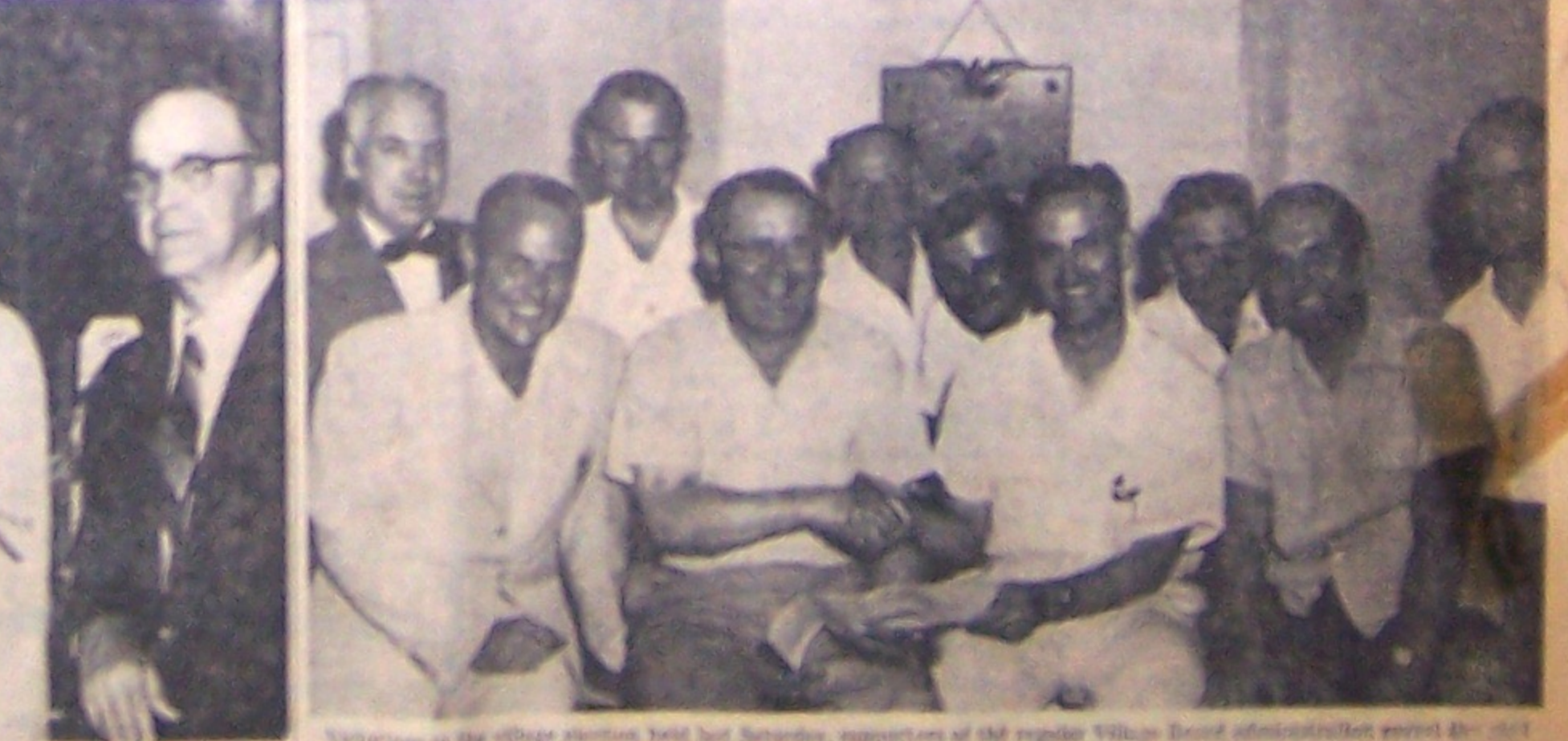
Group photo of supporters of the Lansing Village Board, including men and women.