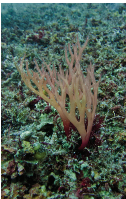
Fig. 2: Sebdenia dichotoma in the field.

Thalli were erect, up to 7 cm in height, reddish, cartilaginous, smooth, rising from a basal disc; fronds slightly