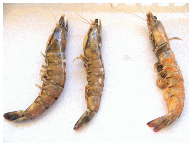
Fig. 5: Three individuals of Melicer-tus hathor caught in the Kastellorizo Island area.

Three individuals (two males and one female) were caught on a 10-20 cm deep sandy bottom, using a brail