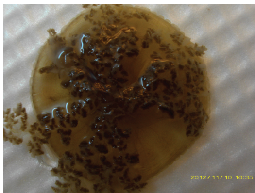
Fig. 6: Cassiopea andromeda collected near Lattakia Port, Syria.

Two young C. andromeda specimens (Fig. 6), 5 cm in diameter, were caught in the coastal waters of Lattakia, about 6 km north of Lattakia port (35°33'48.91" N, 35°43'2.30" E), on 16 November 2012. The temperature and salinity at the sampling time were 21°C and 39 ‰, respectively. The two specimens were collected at depths of 0.5 and 3 m, they were photographed, fixed in 4 % formaldehyde, and stored at the zooplankton laboratory of the High Institute of Marine Research, Tishreen University (Syria).