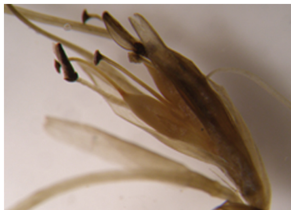
Fig. 1: Althenia filiformis Petit individuals showing: a. the 'runner-like' axes (arrows) and mature female flowers, b. detailed shoot with male flowers consisting of one sessile anther and female consisting of three uni-ovulate carpels, each with a style, bearing a characteristic peltate stigma.

distribution, from the Mediterranean coastal lagoons of Spain, France and Italy (Onis, 1964; Talavera et al. , 1984; Jeanmonod, 2000), Greece (Koumpli-Sovantzi, 1995) Turkey (Den Hartog, 1975), but also Russia (Tsvelev, 1975; Klinkova & Shantser, 1992), South Africa and Iran (Dandy, 1971), the complete distribution of the species is still unknown. There is only scarce information about A. filiformis and very little has been published about this species. According to Cook & Guo (1990), this is due to several reasons: the small hair-like leaves and the greenish-brown colour that simulates the substrate in which the species grows, often makes it invisible from the banks. Also, the frequently mobile and rather sticky and stinking substrate makes direct observations in the field rather difficult. Finally, Althenia is somewhat sporadic in occurrence and does not always appear at the same locality each year. Its sporadic occurrence and the scarce recordings of this species has led to its classification as threatened in the Balearic islands (Fraga, 2009), Çurkova Deltas in Turkey (Çakan et al. , 2005), and it is also included in the National Red List of Italy (Zeno, 2009).