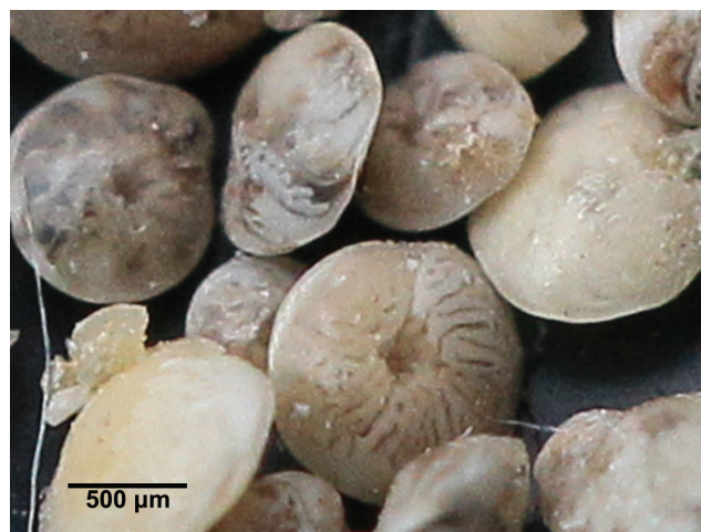
Fig. 7: Amphistegina lobifera from Zakynthos.

Amphistegina lobifera (Fig. 7) was collected from northern Alykanas bay (37.53 N, 20.45 E, NE Zakynthos island, Ionian Sea) on July 2012. It was found in algal material collected at a water depth of less than 0.5 m. During the study period, mean monthly sea surface temperature and salinity reached 24.1°C and 38.56 ‰ respectively. The species dominated the algal foraminiferal popula-