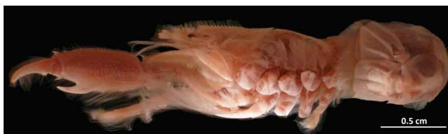
Fig. 4: General view of Gebiakantha talismani , found in Akkuyu, Mersin.

Available information on the thalassinid crustacean fauna of the Turkish Seas is relatively restricted compared to other parts of the Mediterranean. Nevertheless, Ateş et al. (2010), compiling the updated list on Turkish decapod crustaceans, have added five thalassinid species. In June 2012, two individuals of Gebiakantha talismani (Bouvier, 1915) were collected during a grab (0.1 m 2 ) survey cruise along the Turkish Mediterranean coast, the Akkuyu coast of Mersin specifically (36° 11' 45" N and 33° 53' 29" E). A Van Veen grab was used at depth of 78 m on a mud bed covered with mollusc shell remains. The specimens were photographed (Fig. 4) and deposited in the invertebrate collections of the Hydrobiology Department, Faculty of Fisheries, Sinop University with catalogue code: SNU-FF/CRS/2012-01. Ngoc-Ho (2003) reported that this thalassinid species was found on the soft-bottoms (muddy sand) with shells at depths between 20 and 150 m. Likewise, another specimen was found on a bottom with shell remains at a depth of 155 m in southern Spain (García Raso, 1996). According to Ngoc-Ho (2003), the general distribution of the species is along the Central Mediterranean (Malta), Eastern Mediterranean (Lybia and Greece) and northwest coast of Africa, from Morocco to Congo. This is the first record of the genus Gebiakantha from Turkey and, based on this reference, the number of thalassinids in the Turkish seas has increased to six.