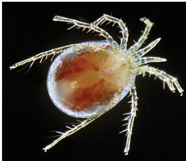
Fig. 8: Pontarachna adriatica female from Piran Bay.

The specimen collected from Piran Bay (Fig. 8) is in good agreement with the original description (Morselli, 1980). In addition, we provide some measurements of the specimen from Piran Bay, which represent the first record of this species found in a gut of a fish from Slovenia.