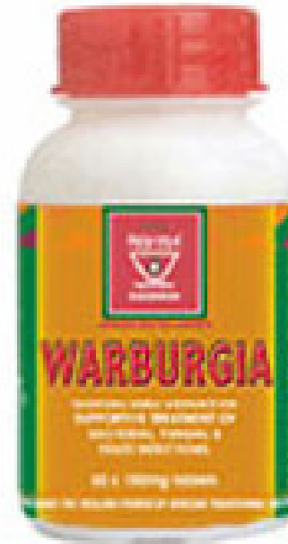
Manufacturer: Africa Red Tea Imports, South Africa

Example of herbal preparations currently in the market.