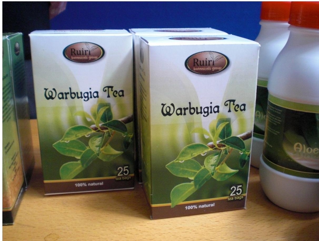
Warburgia ugandensis products from Ruiru Herbalist, Meru Kenya