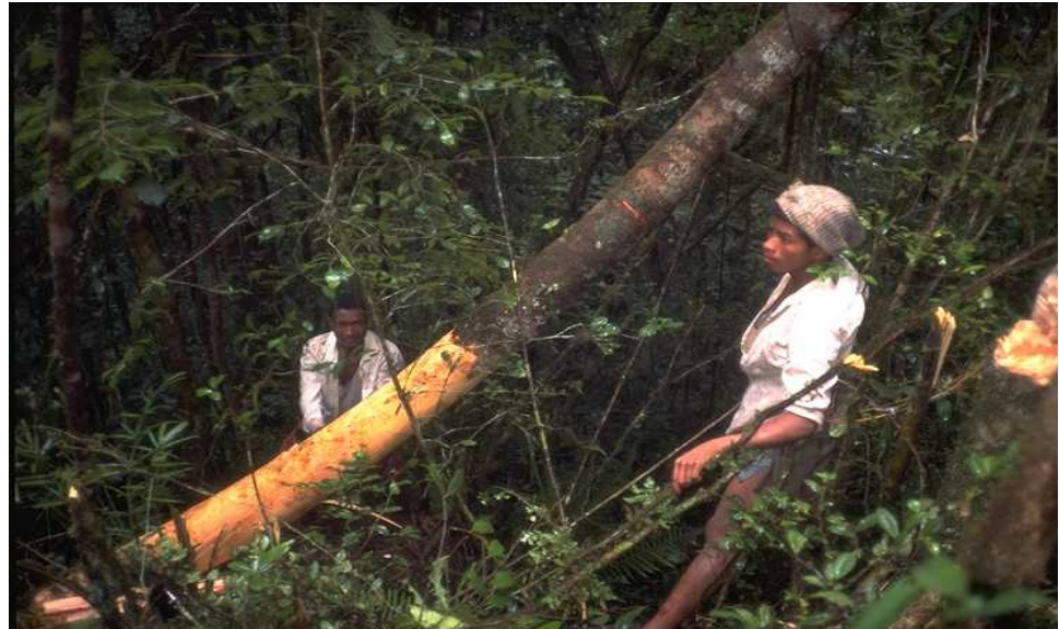
Bark harvesting from a Warburgia tree