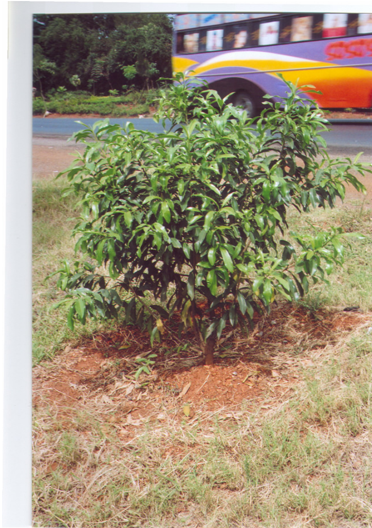
Young Warburgia ugandensis planted along Thika Road in Kenya. Note the coppicing ability