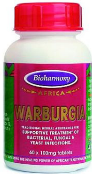
Manufacturer: Bioharmony, South Africa