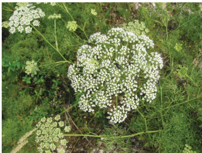
Fig. 1. Ammi visnaga (L.) Lam. (Apiaceae) from Brač (Dalmatia, Croatia).