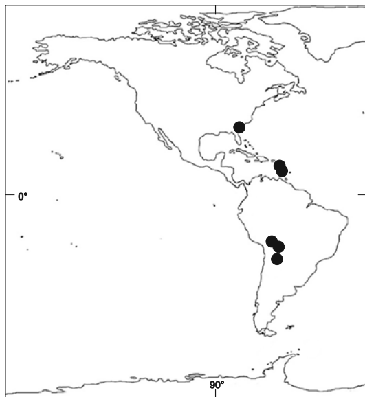
Fig. 3. American distribution of Lecanora stramineoalbida Vain.

17°14'13"S, 65°49'02"W, 2294 m, 10 June 2006, Flakus 8143 (LPB), Flakus 8150,1 & 8157 (KRAM). DEPT. LA PAZ. Prov. Abel Iturralde, near Tumupasa village, 14°08'51"S, 67°53'34"W, 500 m, 31 July 2008, Flakus 11722 & Kukwa (KRAM, LPB), 11731 (KRAM); Prov. Franz Tamayo, between Apolo and Mapiri villages, 14°41'50"S, 68°25'07"W, 1490 m, 22 Nov. 2011, Flakus 22990 (LPB); between Apolo and Mapiri villages, 13 km from Apolo, 14°50'51"S, 68°21'38"W, 1530 m, 23 Nov. 2011, Flakus 23034 , 23035.1 , 23061 (KRAM, LPB); Prov. Muñecas, above Camata, NE slope, 15°15'06"S, 68°46'14"W, 2544 m, 15 May 2006, Wilk 4370b (KRAM); Prov. Nor Yungas, near Pacallo village, 16°12'10"S, 67°50'39"W, 1360 m, 3 Aug. 2008, Flakus 11752 & Kukwa (KRAM, LPB); Coroico village, 16°11'10"S, 67°43'16"W, 1550 m, 6 June 2010, Flakus 16394 , 16397 , 16408 & Rodriguez (KRAM), 16418 , 16427 , 16444 (LPB); COTAPATA, near Urpuma colony, 16°13'20"S, 67°52'34"W, 1989 m, 30 June 2010, Flakus 17156 & Rodriguez (KRAM), 17303 (LPB). DEPT. TARIJA. Prov. Aniceto Arce, Serranía de Propiedad Arnold, 22°13'19"S, 64°33'41"W, 1309 m, 24 Nov. 2010, Flakus 18763 (LPB); Prov. Burnet O'Connor, Lomas de la Soledad, road between Entre Ríos and Chiquiaca, 21°39'38"S, 64°07'31"W, 1670 m, 10 Aug. 2012, Flakus 24174 (LPB); Papachacra, 21°41'36"S, 64°29'33"W, 2195 m, 26 Nov. 2010, Flakus 19939 & Quisbert (KRAM).