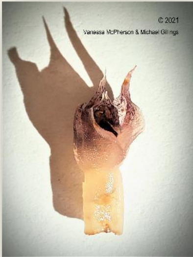
Rhizanthella slateri – a single flower!