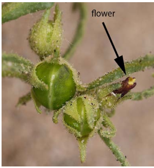
Oryctes nevadensis