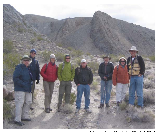
Vaughn Gulch Field Trip