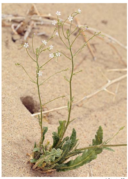
Aliciella lottiae