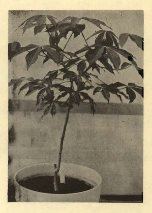
Figure 2. This plant, initially exposed to low temperature, developed symptoms of the Caribbean mosaic (lower leaves). The plant recovered when maintained at a temperature above 30°C (upper part of foliage).

Research carried out at CIAT to identify the causal agent of the Caribbean mosaic, isolated a flexous virus-like particle. It seems to be a Potexvirus, named BPL to facilitate its identification. This virus is serologically related to the cassava common mosaic and the N-WF viruses, but its host range differs and, in Secundina, it induces symptoms different to those originally observed in material affected by Caribbean mosaic. Field experiments suggest the presence of a vector still unknown.