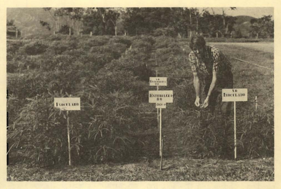
Figure 1. Mycorrhizal inoculation is essential in sterilized soil; otherwise, plant development is drastically affected by the absence of a mycorrhizal association.

Results in Quilichao. VAM inoculation did not increase yield in nonsterilized soil; however, it did increase yield in sterilized soil (from 31 to 50 t/ha) without phosphorus application. Thus, even though noninoculated plants had recuperated from their initial phosphorus deficiency in sterilized soil, inoculation still increased their yields by 60%.