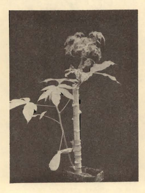
Figure 3. The presence of a latent virus in the stock (symptomless) was determined when grafted to the healthy clone Secundina. The latter produced severe symptoms.

Another latent virus, found recently at CIAT, affects a high percentage of cassava clones existing in the Americas. In order to detect it Secundina was grafted to the clone being tested. If infected, the leaves that developed in Secundina showed curling and severe mosaic as well as vein necrosis (Figure 3). The symptoms of this mosaic differ from those of the Caribbean mosaic under controlled conditions. Partial purifications showed the presence of low concentrations of polyhedral particles of approximately 30 nm. To date the virus has not been successfully transmitted to any other differential species.