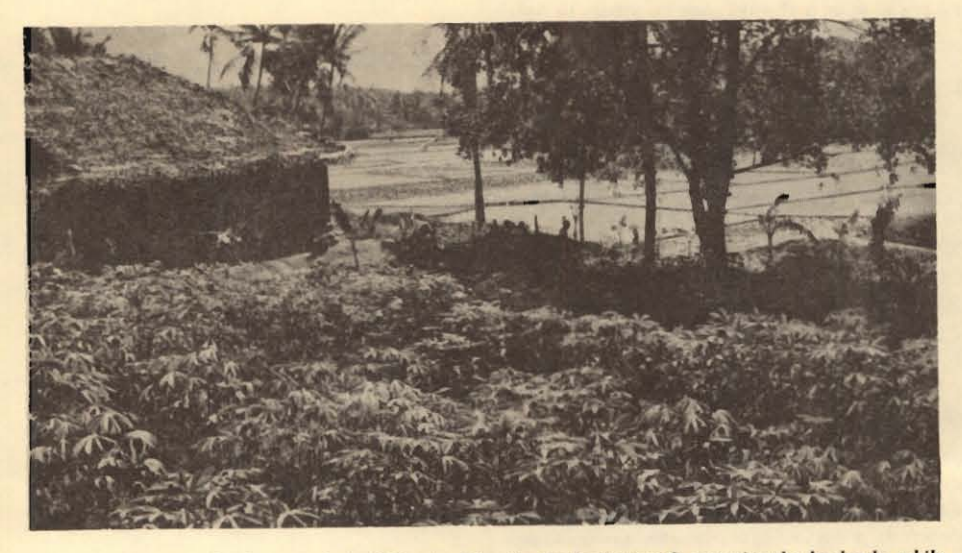
Figure 1. Intensive land use typical of Kerala. Rice (in the background) occupies the lowlands, while cassava and tree crops are grown on upper lands.

Tamil Nadu. Cassava in Tamil Nadu is mainly used in the starch and tapioca pearl industry, which is