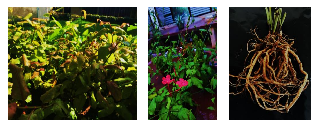
Plate 1. P. indica (a) Plants (b) Flowers (c) Tuberous roots

P. indica has wide range of pharmacological activities against many diseases. Currently plumbagin is mainly extracted from P. indica roots [8]. As plant does not produce seeds, shoot cuttings are mainly used for the vegetative propagation [9]. This plant has a slow growth and take considerably long period of time for roots to be ready for medicinal purposes [8]. P. indica rapidly decline from their natural habitat due to over exploitation for commercial uses [10]. Normally distractive harvesting is done as the root system of this plant used in preparation of traditional medicines [9]. Therefore in vitro plant propagation methods are used as an alternate strategy for sustainable conservation and propagation of P. indica [10].