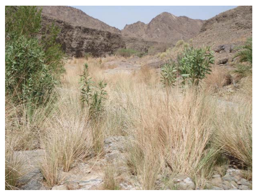
Fig 6. A large stand of dry S. kajkaiense , a somewhat unusual sight.