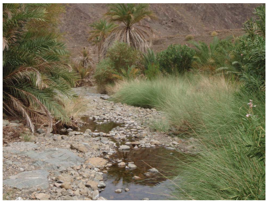
Fig 3. Abundant Saccharum kajkaiense (right) in Wadi Musah.