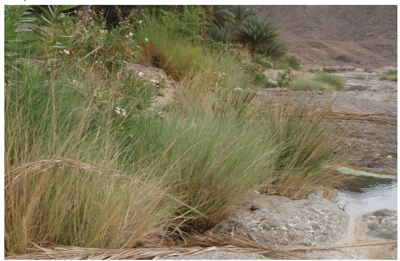
Fig 1. Saccharum kajkaiense along Wadi Khadra, showing its affinity for low ground. A clump of S. ravennae is visible at top, left of centre.

On the East Coast of the UAE, permanent water is relatively scarce except in Wadi Wurayah, which features the UAE's only year-round waterfall. There a single S. kajkaiense plant was found within the forest of Arundo donax reeds and S. ravennae above the falls. A byproduct of that particular visit was the discovery of the tall, reed-like sedge Cladium mariscus , apparently a first record for the UAE. Other potential East Coast sites in Wadi Safad and Wadi Hayl did not reveal S. kajkaiense . However, it is not unreasonable to expect it to occur to the south, in some of the larger, wetter wadis of the Batinah coast of Oman.