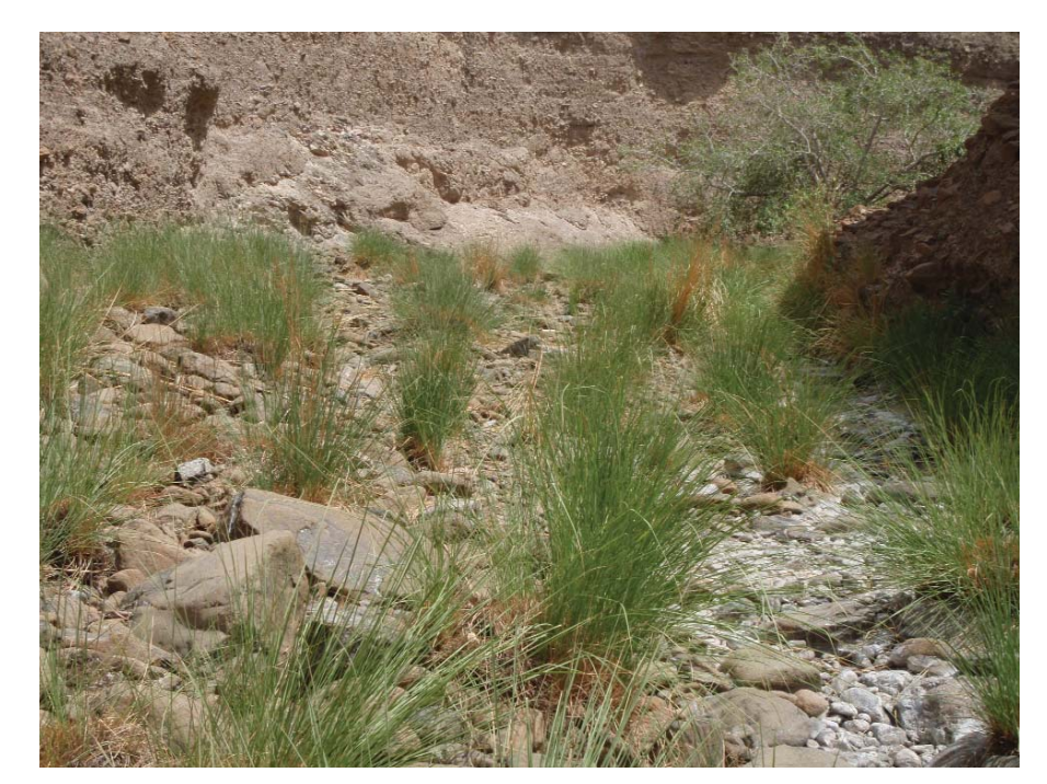
Fig 4. A monospecific stand of small Saccharum ravennae in a wadi near Hatta.