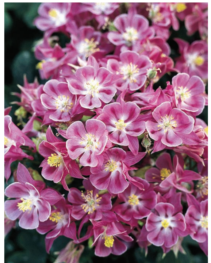
'Winky Blue-White' (left), along with 'Winky Red-White' and 'Winky Rose-Rose' (right), received the Fleuroselect Quality Medal.