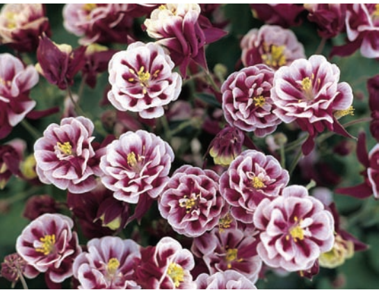
'Winky Double Red-White' was awarded the Fleuroselect Novelty Medal.