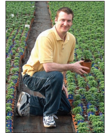
By Paul Pilon

This award-winning columbine series is uniform in growth and flowering habit. Its dwarf size reaches 10-12 inches in containers and 15-18 inches in the landscape.