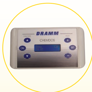
Easy to Program