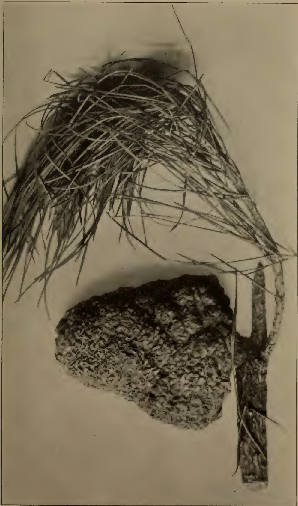
Peridermium cerebrum Peck, causing abortion of cone on Pinus chihuahuana