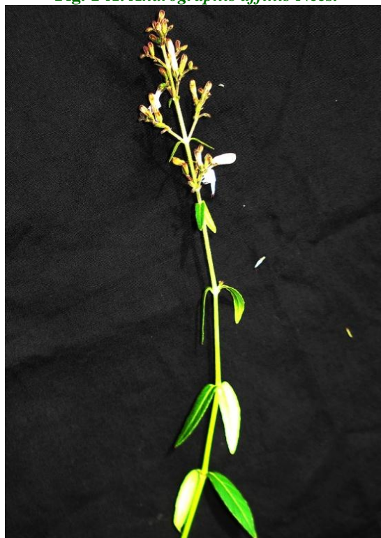
Fig. 1-A: Andrographis affinis Nees.

Skullcapflavone I 2'-O-β-D-glucopyranoside and Andrographidine C are the two new acylated flavone glycoside, determined as skullcapflavone I 2'-O-β-D-(3''-E-cinnamoyl) glucopyranoside and skullcapflavone I 2'-O-β-D-(2''-E-cinnamoyl) glucopyranoside and both were isolated from the whole plant of A. serpyllifolia . Structural elucidation of the glycosides was achieved by various NMR techniques including 2 d NMR (1H-1H COSY, HMQC, HMBC and ROESY experiments, FAB-mass spectrometry, saponification and acid hydrolysis (Govindachari et al., 1968; Damu et al., 1999). Different categories of chemical compounds in Andrographis spp. and their molecular structure are given in Fig. 2.