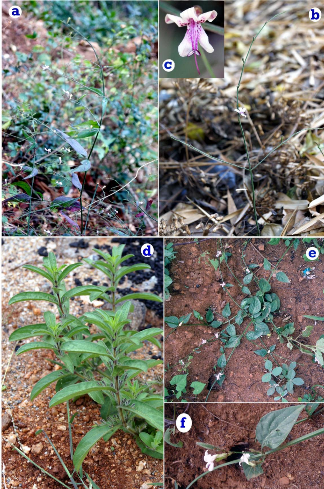
a-c: Andrographis alata – a) habit; b) inflorescence; c) flower; d: Andrographis echioides -habit; e-f: Andrographis elongata – e) habit; f) flowers with young fruit.