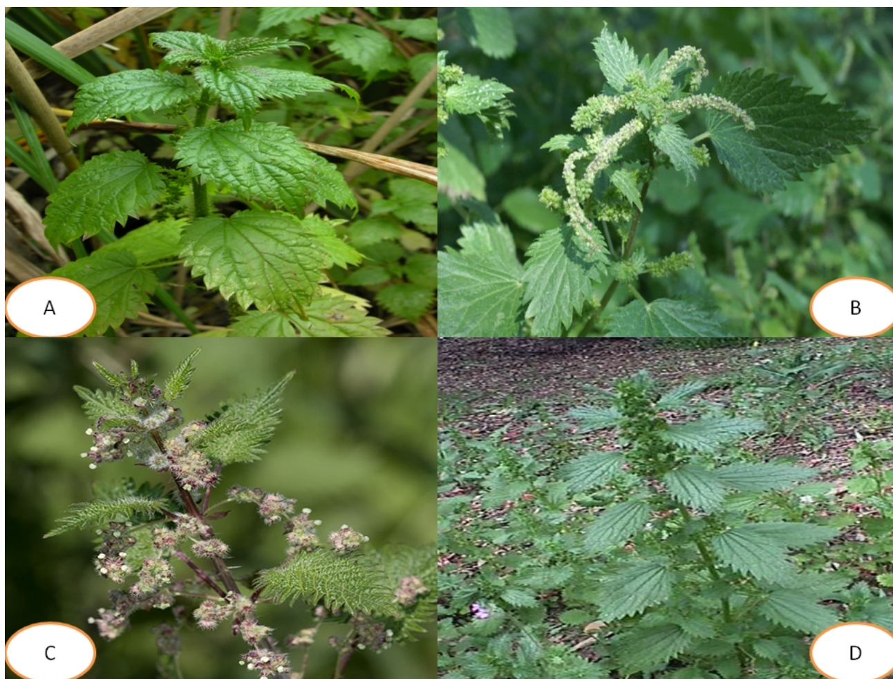
Figure 1: A. Urtica kioviensis , B. Urtica membranacea , C. Urtica pilulifera , D. Urtica urens