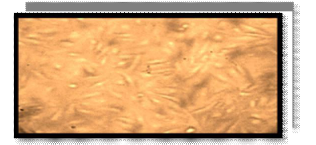
Fig. 1a Normal HeLa Cell line Cytotoxicity effect of Vitex trifolia on Hep G2 cell line