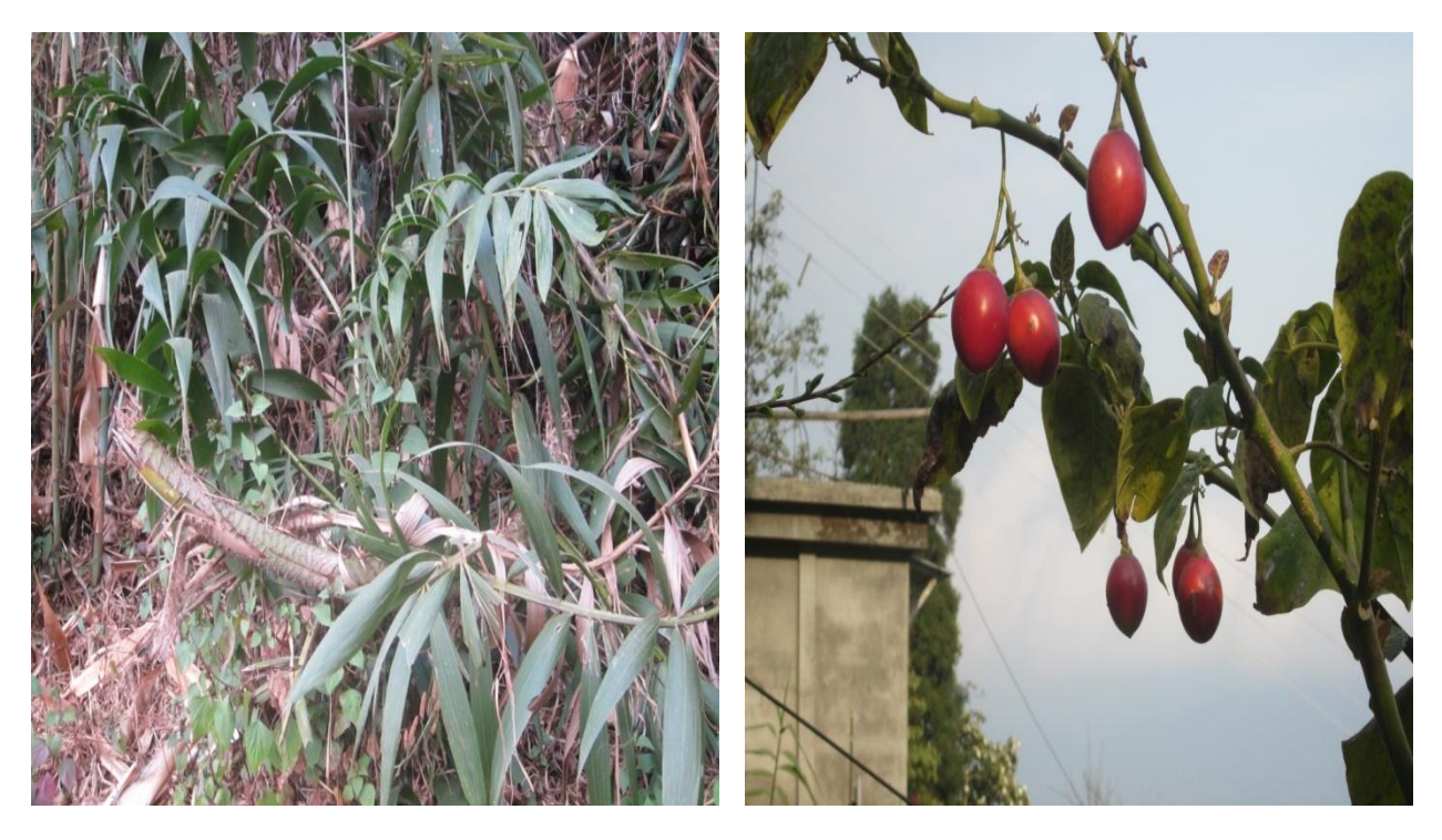
Figures 7-8: Cyphomandra betacea Cav. (Rukh

Tamato of Solanaceae) fruits in a local Home garden at Udaygram, Darjeeling in the left and Calamus sp. (Arecacea) in the right.