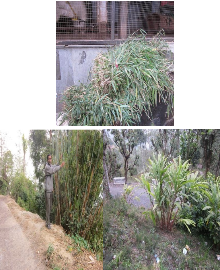
Figures 18-20: Gharia Sishnu (Near House), Mali Bamboo and Amomum subulatum (Baro Alaichi). PHOTO PLATE -6