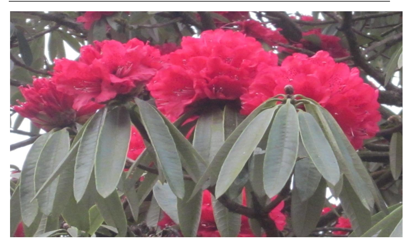
Figure 9: Rhododendron arboreum Smith (Lali Guras) blooming in stage at Pandam, Darjeeling.