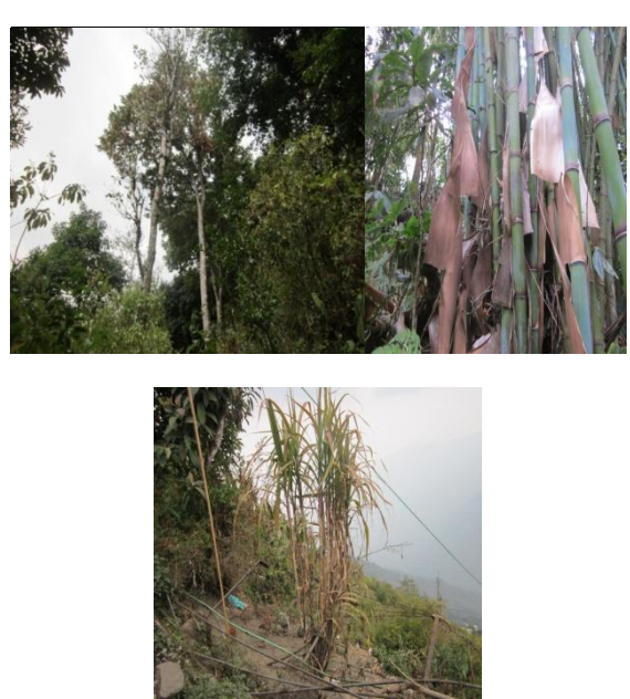
Figure 45-47: Dense Vegetation with Three layered canopy (>70 percent canopy cover) of trees on the ridges of Hills at Mulgaon forest, Bamboo thicket (Parang), Saccharum officinarum L. (Sugarcane locally called Ukhu) in the same village of Darjeeling, West Bengal, India

showing growth of mixed species of mosses on acidic substratum, where luxuriant growth of Funaria hygrometrica along with Pogonatum, and Polytrichum takes place. These micro communities may change due to overburden of heavily growing tree species like Alnus (Utis) in the said area through progressive change of age of the forest community, at Hill slopes.