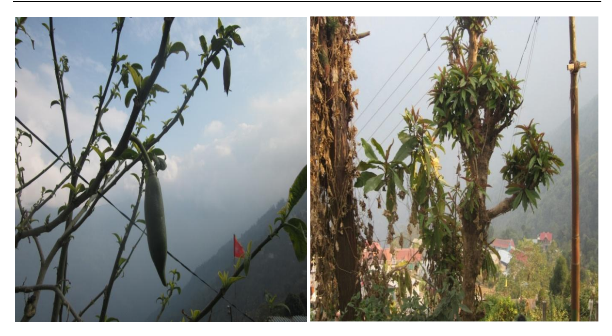
Figures 5-6: Fruit bearing Solanaceous Trumpet tree ( Brugmansia suaveolens Berchst. & J. Presl) at left and Gagun tree ( Saurauia napaulensis DC. )as a fodder tree at the right.