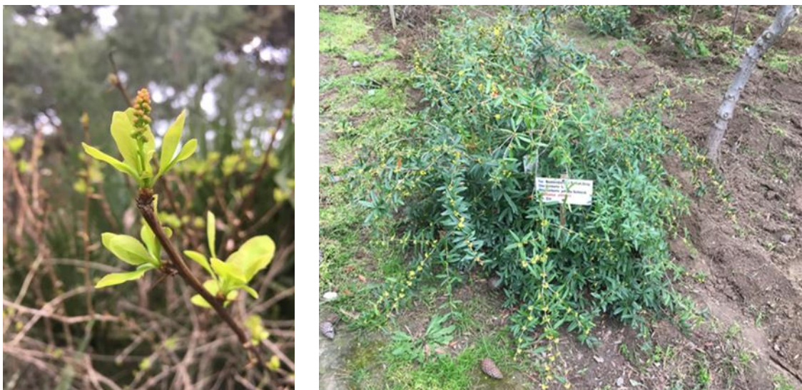
Figure 1. Onset of early vegetation in species of Berberis amurensis and B. julianae