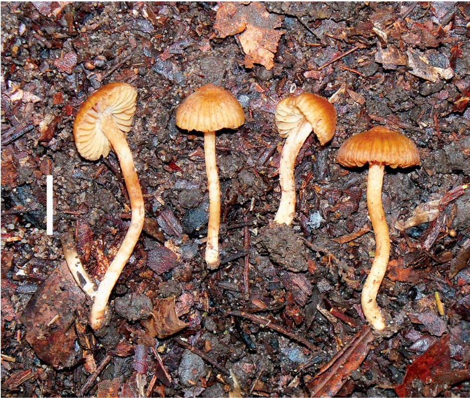
Figure 1. Inocybe lepidosparta (holotype). Basidiomes in situ. Scale bar = 10 mm.

crenulate edge; lamellulae very common, the shortest ones abruptly truncate and the longest rounded obtuse. Stipe (22–) 31–40 × 2–3 mm, equal, cylindrical, buff (OAC 776–777); scattered fibrillose-squamulose ornamentations over entire length, pruinose only at very apex near lamellae; context pale cream, longitudinally fibrillose. Odour indistinct.