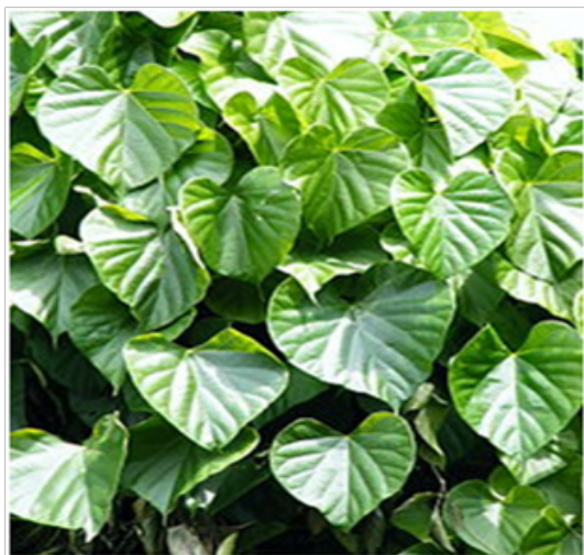
Figure 1 The heart shaped leaves of Tinospora cordifolia .

As described in the classification, T. cordifolia belongs to the Menispermaceae family and the shrubaceous deciduous plant that grows to about 3–4 feet in height and is about 1 feet in width. The climbing plant is seen to bear lots of spreading slender branches which grab on to the nearby objects for support. The leaves that are seen are simple, alternate, and exstipulate, with petioles up to 15cm in length, bearing roundish and pulvinate leaves at apex and basal region; the basal region being much longer and partially twisted half way around. The flowers that are seen are observed are small and unisexual; female and male flowers are seen in different plants. On the flowering season, the plants bear no leaves and the flowers bear yellowing green color and the flowers are positioned at the apex and terminal racemes. The differentiations in the sexes are seen in the form that the male flowers are usually clustered and the female flowers are solitary in positioning. The sepals and petals are 6 in number and are usually free or grouped in 2 or 3 numbers. The fruits are found in an aggregate of 1–3 drupes with scarlet or orangish coloring. The seeds are curved and pea sized and are transverse dehiscent in nature. The roots which are present in this plant are seen in both underground and aerial form (Figures 1–3).