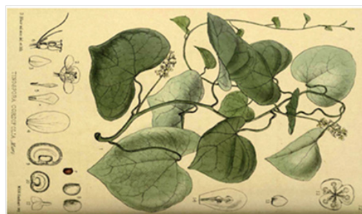
Figure 3 A botanical diagram describing the leaves, flower, seed and various other arrangements of the Tinospora cordifolia plant.