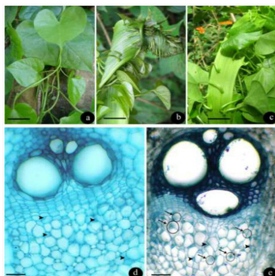
Figure 5 The above figure shows the differences between normal and infected plants at the external appearance and at the cellular orientation wise. Box (A) depicts appearance of healthy plant; box (B) and (C) depicts the appearance of an infected plant. Box (D) depicts the vascular bundle arrangement in healthy plant and box (E) depicts the xylem and phloem arrangement in an infected plant and the circled area indicates the presence of phytoplasma. The cells were stained using Diene's staining method. 9

The Tinospora cordifolia plant had been appreciated to high levels for the medicinal, therapeutic, curative, healing and relieving nature. Though the plant has a strong defense against microorganisms, pests and insects, the plant in itself is not invincible and is bound to be affected by various diseases and one of the diseases that prominently affect the plant have been mentioned below. The new flat stem disease that infects the branches and the infected plant bears small leaves and it was observed that the same nodal region bears multiple new leaves ranging to about 20 to 30 in number and the older leaves are fewer in number and compared to normal plant the internodal region is shorter in the winter and the causal organism of this disease is phytoplasma. The differences in the infected and normal plant is not just restricted to the physical appearance but the irregular arrangement the phloem and xylem systems are visibly observed and the sieve components and the vascular bundle bear altering arrangements to the normal cells 27 (Figure 5).