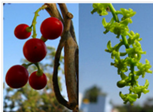
Figure 2 The seeds and flowers of Tinospora cordifolia plant.