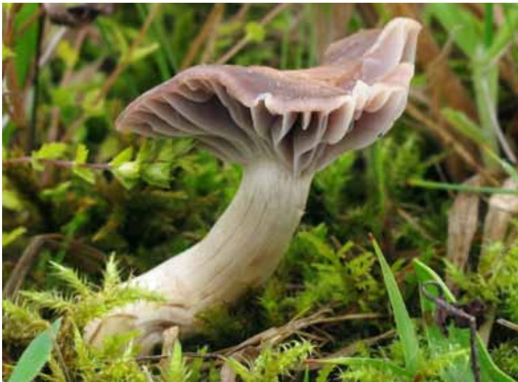
Hygrocybe flavipes , Slovakia, Turzovská vrchovina Mts., Čadca, Sihelník village, 21 September 2013, J. Zajacová, M. Zajac (BRA). see p. 5–23.