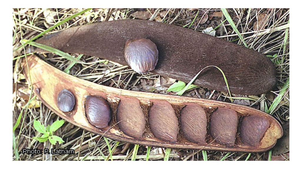
Plate 2: Pentaclethra macrophylla Benth pod with seeds

http://database.prota.org/PROTAhtml/Photfile%20 Images%5 CPentaclethra%20 macrophylla%20 fruit%20 and %20 seed. JPG