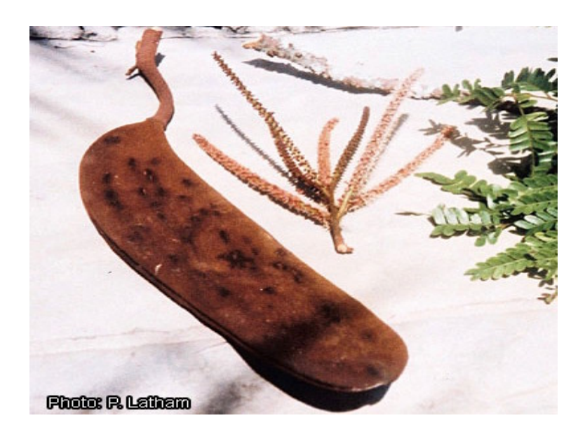
Plate 1: Pentaclethra macrophylla Benth seed pod with leaves http://www.prota4u.org/plantphotos/Pentaclethra%20macrophylla%202.JPG