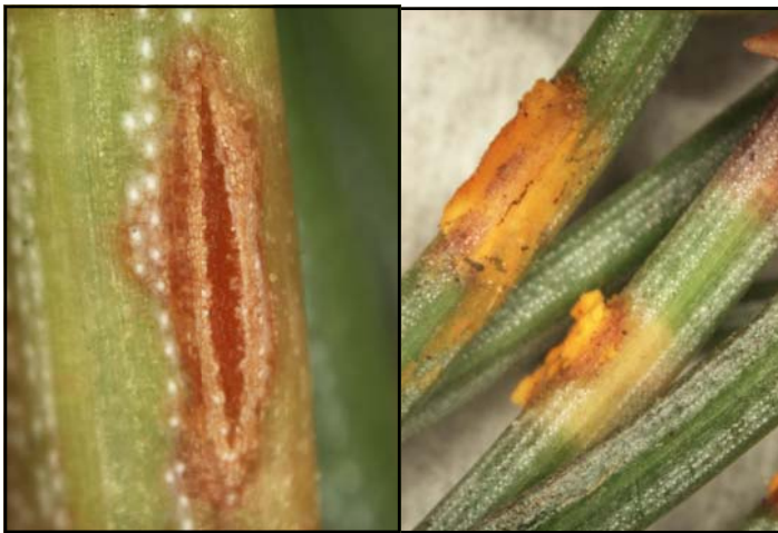
Figures 3 and 4. An individual pustule just splitting open on the L, and spores developing from more mature fruiting bodies on the R.

This spruce needle rust is somewhat unique, because it does not require an alternate host. Needles that become infected in the spring begin to develop yellow spots or bands in late winter or early spring of the following year , with bright yellow waxy blisters developing on the discolored areas of the needles. As the pustules develop, the surface of the needle may begin to split and as the fruiting body continues to mature, they release masses of yellow-orange spores ( Figs. 3 and 4 ) that infect the newly emerging growth. Soon after sporulation is complete, the needles infected the previous year begin to drop from the tree. Where infection levels were heavy, many of the previous season's needles may be lost. Over time, heavily infected trees may be weakened or become less aesthetically pleasing, but they are rarely killed.