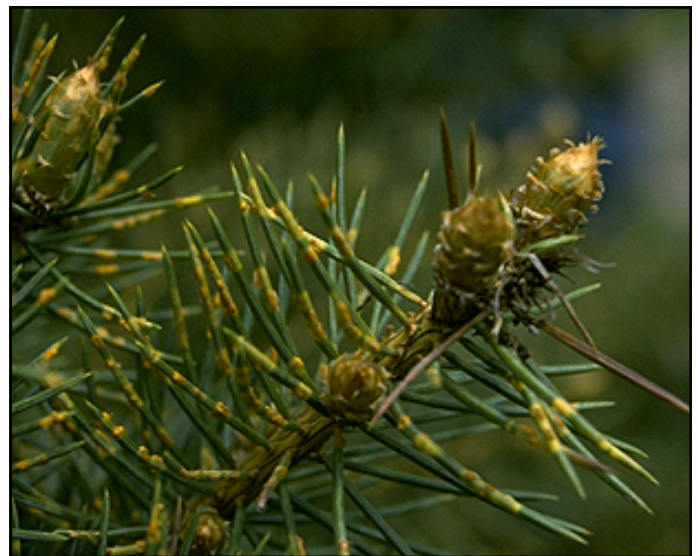
Figure 5. Blister-like fruiting bodies on blue spruce needles in the spring. Note that buds are swollen, but have not yet broken.

fungal spores may be wind dispersed, in low lying areas, the fungus may colonize the foliage at all levels with only the very tops of larger trees exhibiting minimal evidence of disease. In a landscapes, if this problem is noted early when infection levels are still low, it may be possible to prune out some of the worst of the lower branches to try to minimize future infections. However, if plants are located in valleys or other low lying areas, or surrounded by tall trees or structures that may restrict airflow, plants may suffer more severe level of infection ( Fig.5 ) that will likely require some treatment to preserve the aesthetic value of the tree. As the pathogen is fungal, moist conditions on the needles allow may increase infection. Trees planted in open areas or high elevations, where foliage may dry more rapidly following rainfall, may naturally exhibit much lowers levels of infection.