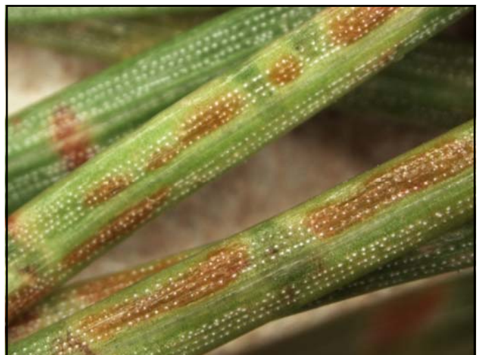
Figure 2. Fruiting bodies (telia) just beginning to cause a swelling of the surface on infected blue spruce needles