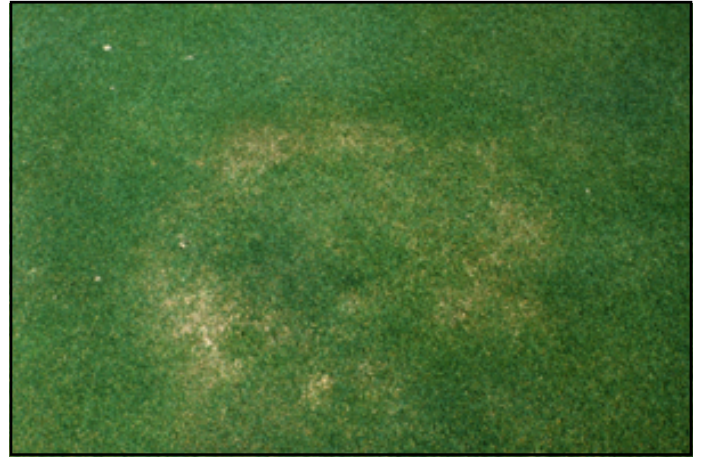
Figure 1: Symptoms of a Summer Patch infection

It can be difficult to diagnose this disease by symptoms alone in the early stages. Symptoms begins as scattered small round patches of thin, wilted or slow growing turf. Initially, these patches may be only 3-8 cm in diameter, but they may enlarge to about 30 cm in diameter (about 12 inches) and range from gray-green to light tan or straw-colored (Fig. 1).