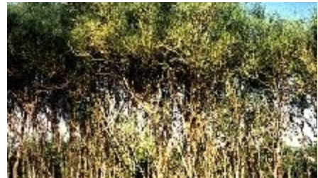
Windbreak: A windbreak of E. tirucalli in a farm at Kibos near Kisumu, Kenya. The row of trees is about 6 m high. (Phanuel O. Oballa)