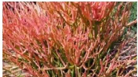
Trimmed live hedge: A trimmed dense live hedge of E. tirucalli near Kariandusi on the Nairobi - Nakuru road, Kenya. The acacia thorns on the hedge are added to further deter penetration by intruders. (Phanuel O. Oballa)