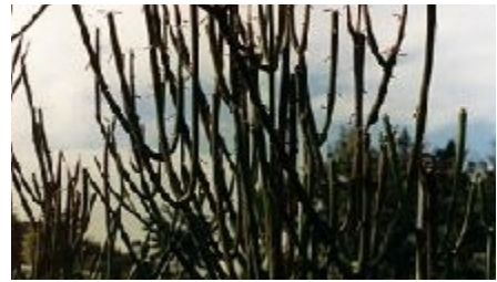
General habit: A large unarmed shrub or small tree up to 5 m tall. Branchlets are slender, smooth and cylindrical. Small leaves can be observed appearing on young green branches. The tree is at Muguga, 25 km northwest of Nairobi, Kenya. (Phanuel O. Oballa)

Plants usually produce male flowers. Female flowers or plants much less common. Plants with bisexual cyathia also occur, although the female flower apparently often aborts. E. tirucalli flowers in October and fruits from November-December and is pollinated by insects.