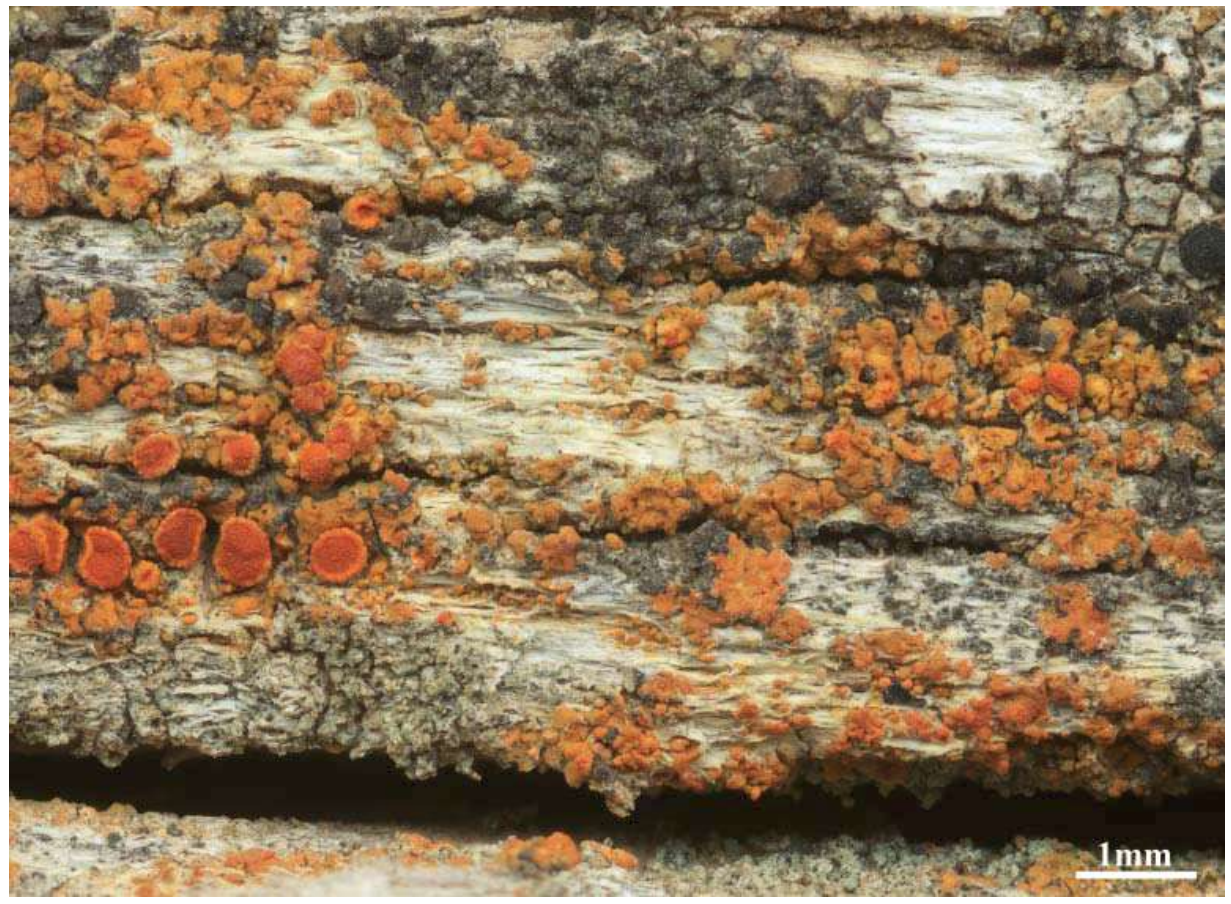
Caloplaca durietzii.