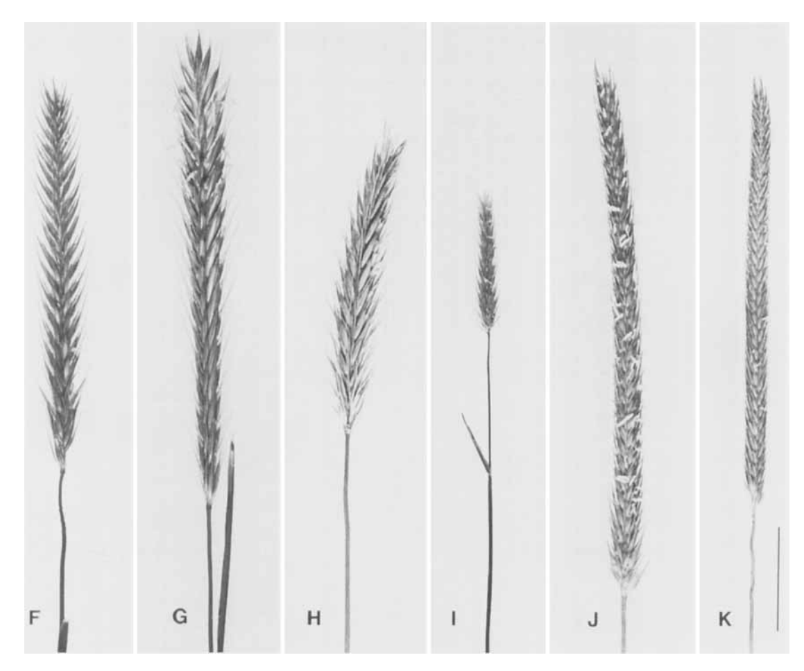
Fig. F-K. Fig. F. H. tetraploidum \times H. bulbosum , hybrid (HH 2154). Fig. G. H. tetraploidum (HH 1203). Fig. H. H. secalinum (H 296). Fig. I. H. secalinum , dihaploid 2n = 14 (HH 1103). Fig. J. H. cordobense (H 1702). Fig. K. H. cordobense , monoploid 2n = 7 (HH 1531). – Bar is equal to 2 cm.

H. cordobense (2x), H. lechleri (6x), H. procerum (6x), H. arizonicum (6x), H. marinum (2x)and 4x H. secalinum (4x), H. brevisubulatum (4x and 6x) and H. vulgare (4x) are capable of eliminating up to two bulbosum genomes. However, CAUDERON and CAUDERON (1956) reported development of H. bulbosum sectors in the cross H. secalinum \times H. bulbosum (4x) which is contradictory to our results and to those of GAJ and GAJ (1985).