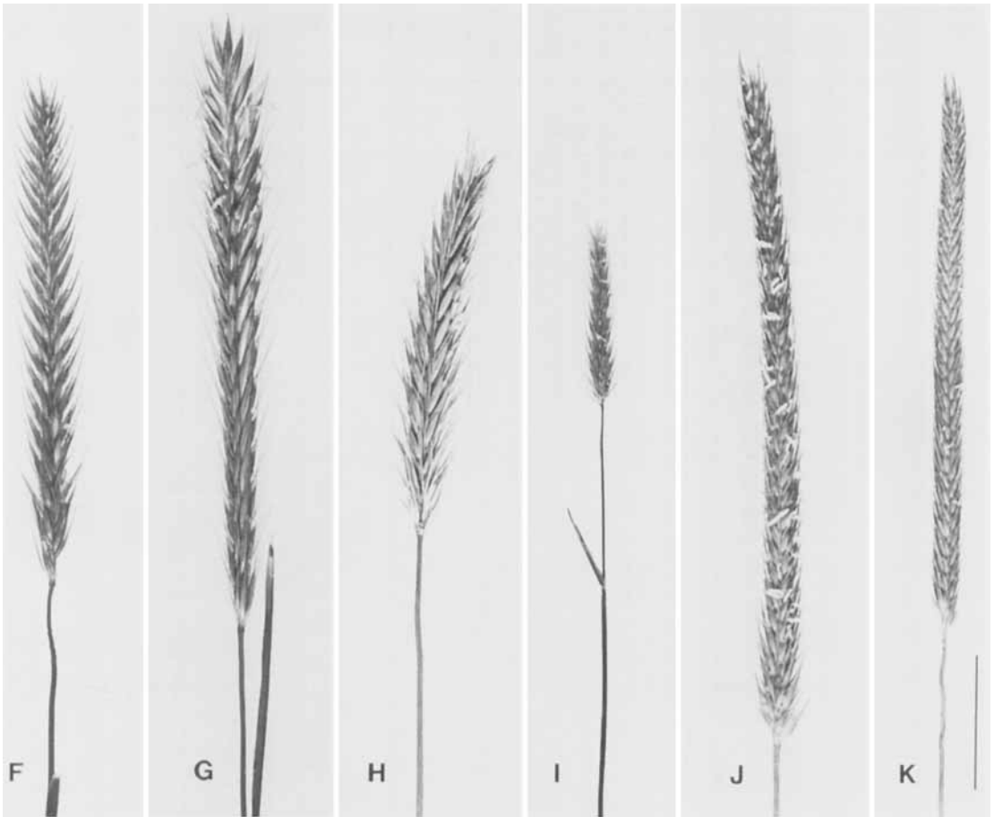
Fig. F-K. Fig. F. H. tetraploidum × H. bulbosum , hybrid (HH 2154). Fig. G. H. tetraploidum (HH 1203). Fig. H. H. secalinum (H 296). Fig. I. H. secalinum , dihaploid 2n = 14 (HH 1103). Fig. J. H. cordobense (H 1702). Fig. K. H. cordobense , monoploid 2n = 7 (HH 1531). – Bar is equal to 2 cm.

H. cordobense (2x), H. lechleri (6x), H. procerum (6x), H. arizonicum (6x), H. marinum (2x and 4x) H. secalinum (4x), H. brevisubulatum (4x and 6x) and H. vulgare (4x) are capable of eliminating up to two bulbosum genomes. However, CAUDERON and CAUDERON (1956) reported development of H. bulbosum sectors in the cross H. secalinum × H. bulbosum (4x) which is contradictory to our results and to those of GAJ and GAJ (1985).