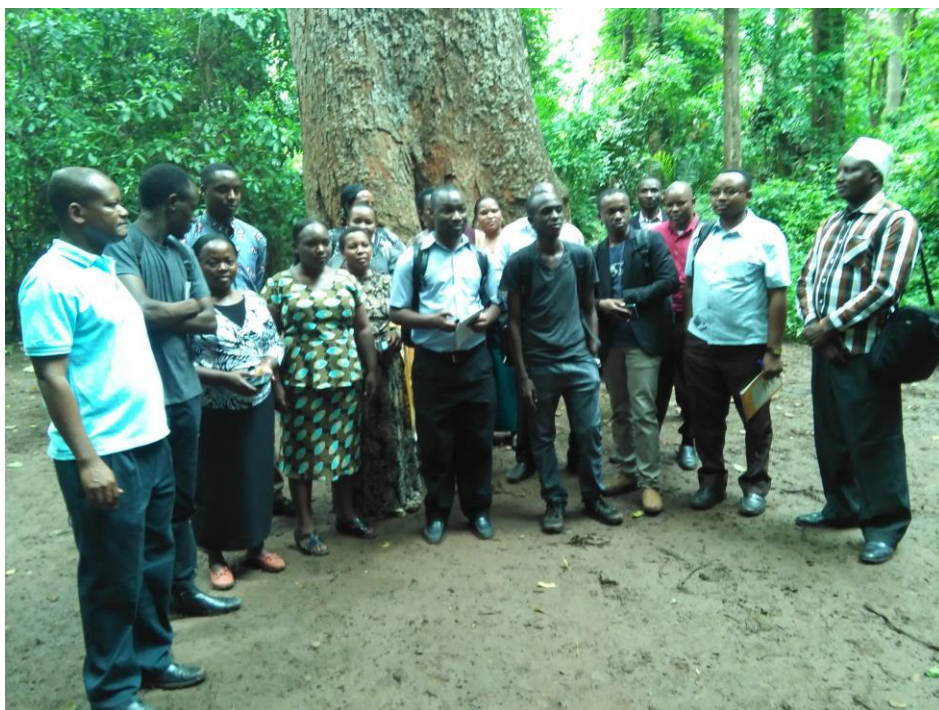
Plate 2: Geography Field Practical students visited Rau Forest Reserve in 2018. At the back is the Melicia excelsa , a huge tree in Africa.

It was further found that, several people organize a picnic in the forest. Picnic needs a cool place where people can sit, meet and do whatever they want including meetings, birthday party, wedding and others. Picnic is an occasion when a packed meal is eaten outdoors, especially during an outing to the countryside. In Rau Forest Reserve picnic is done anywhere but in most cases is done close to Melicia excelsa , a large and tallest tree in the forest (Plate 1).