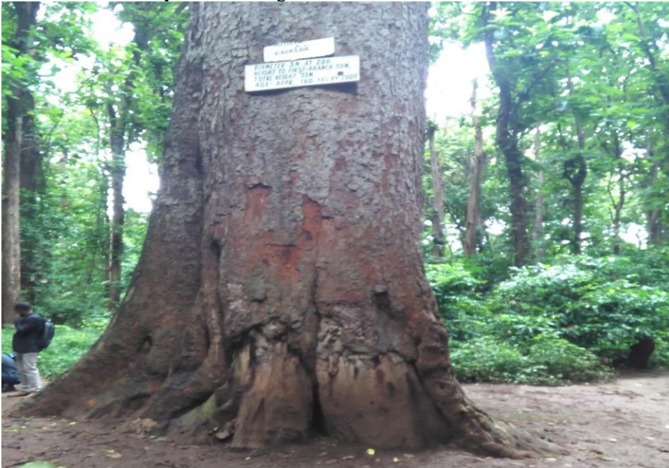
Plate1: Melicia excelsa , a 50m tall tree found in the Rau Forest Reserve

Melicia excelsa is a huge, biggest and tallest tree in the Rau Forest Reserve. Melicia excelsa (Plate 1) is the 50m tall tree considered to be the largest in Africa and found at the centre of the Rau Forest Reserve. The uniqueness of this tree becomes attractive icon to many tourists from different countries and some rituals are performed under it such as initiation, worshipping and other traditional rituals. The area is also used as a briefing place for students, researchers, tourist and other visitors to the forest. Plate 2 present students who visited the forest for studies, it was a study tour. Research and studies is allowed in the forest as a way of enhancing benefits of the Rau Forest Reserve.