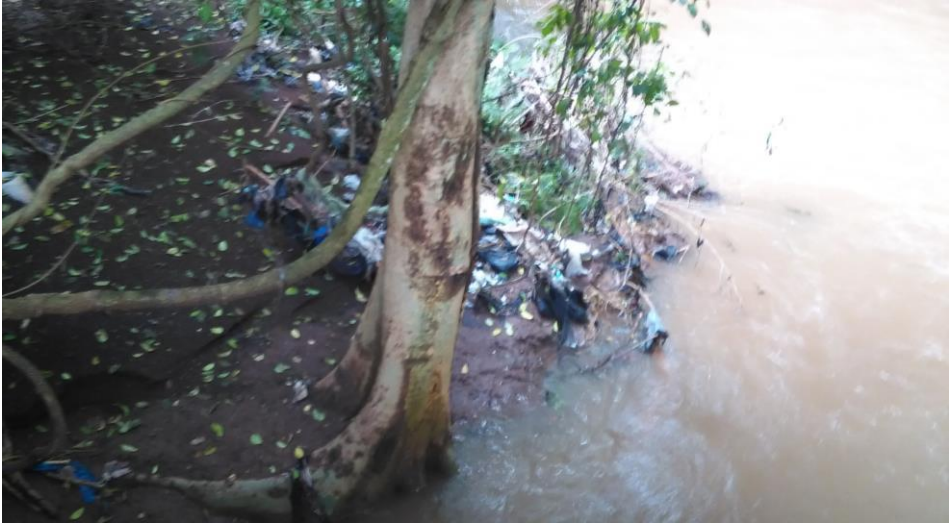
Plate 3: Milk spring water found in the Rau River Forest.

River Rau is another feature found in the Rau Forest Reserve (Plate 4). The forest i.e. Rau Forest Reserve is named after this river which crosses the forest from North to the centre part of the forest. Plate 4 presents part of the Rau River. The water from the Rau River is used for paddy irrigation and for domestic activities. The Rau Forest Reserve is crossed by three rivers which are Rau River, Mamba River and Mana-nguruwe River. These rivers provide water for irrigation to the people living around these rivers.