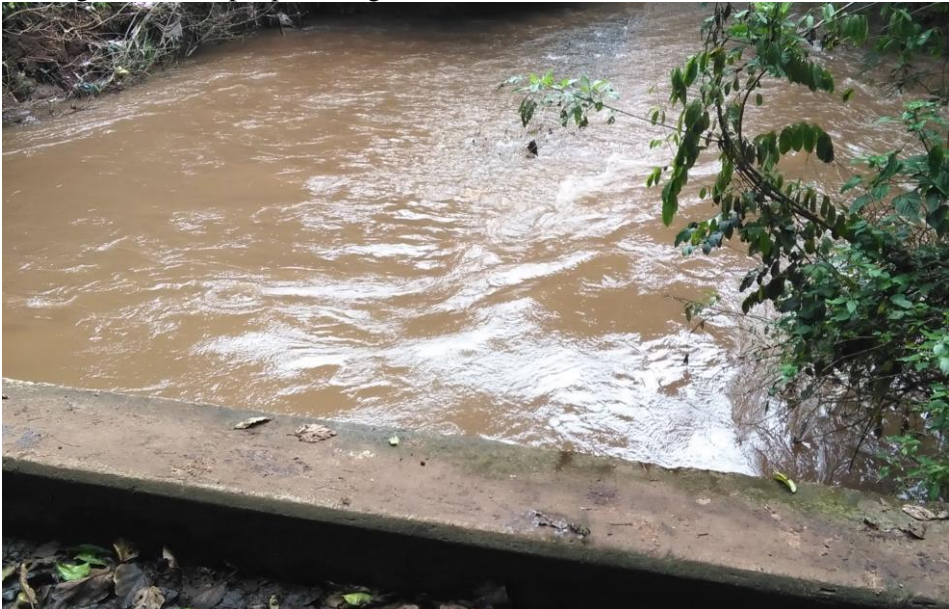
Plate 4: River Rau, a river crossing the forest

River Rau is another feature found in the Rau Forest Reserve (Plate 4). The forest i.e. Rau Forest Reserve is named after this river which crosses the forest from North to the centre part of the forest. Plate 4 presents part of the Rau River. The water from the Rau River is used for paddy irrigation and for domestic activities. The Rau Forest Reserve is crossed by three rivers which are Rau River, Mamba River and Mana-nguruwe River. These rivers provide water for irrigation to the people living around these rivers.