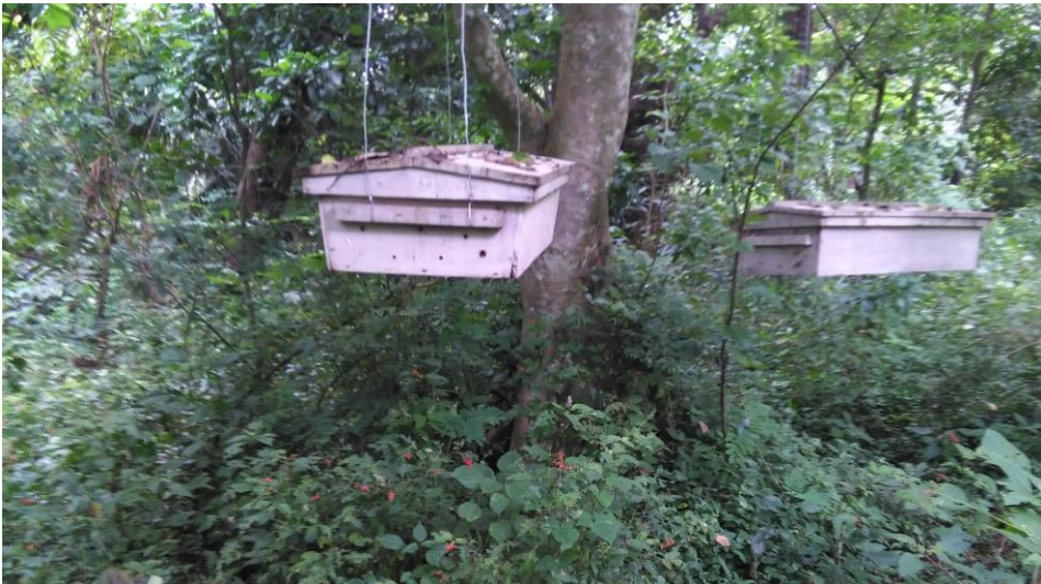
Plate 6: Bee hives used for bee-keeping is hanging on the tree

“Bee-keeping is allowed in the forest because it is compatible with the forest. It involves only hanging the beehives in the trees and leaves them there for sometimes before harvesting. Bees can be harvested twice a year”.