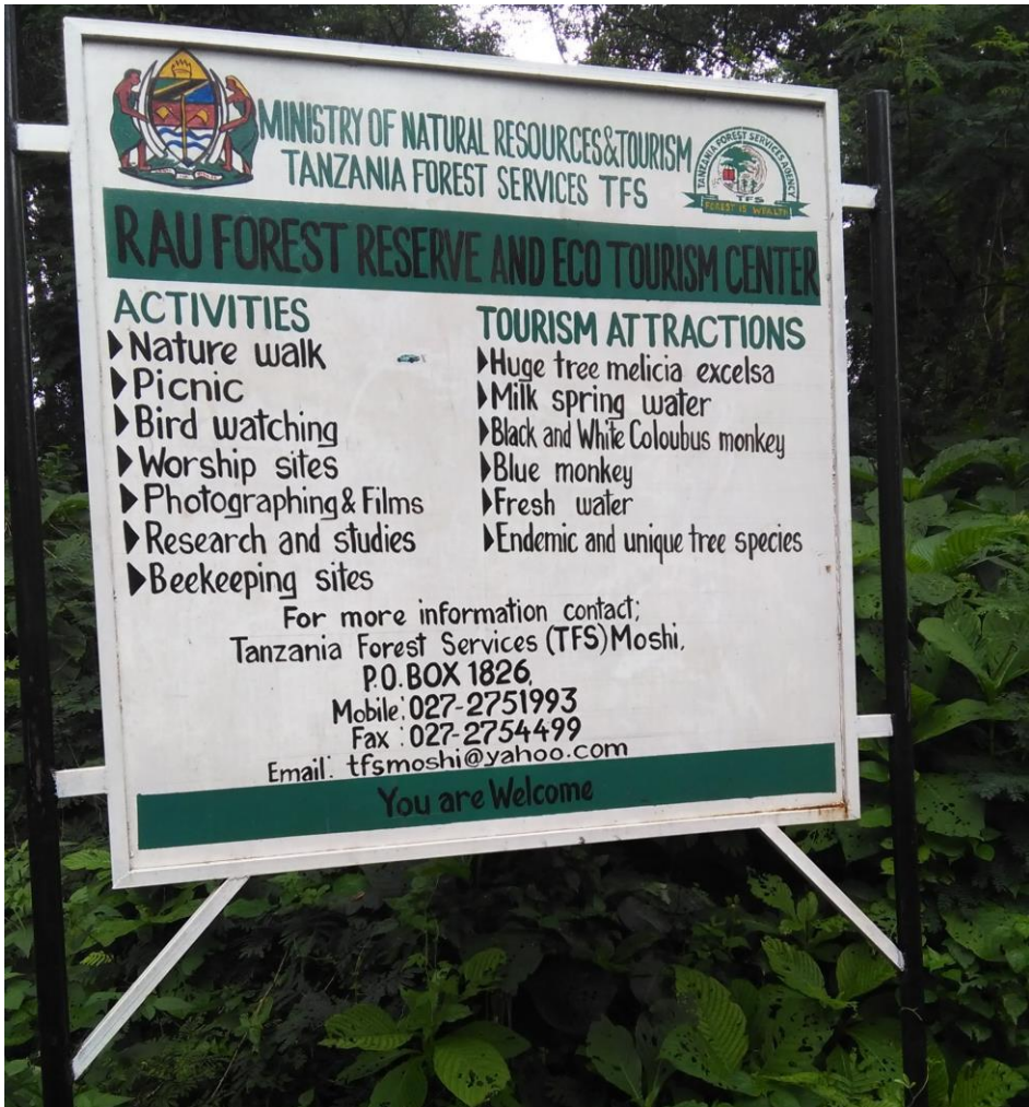
Figure 7: Tourism attractions and activities allowed in the Rau Forest Reserve

allowed to conduct research for their studies in Rau Forest Reserve. Students have developed their thesis with focus to this forest. Other people have published papers with bearing to Rau Forest Reserve. TAFORI is allowed to conduct research in Rau Forest Reserve.