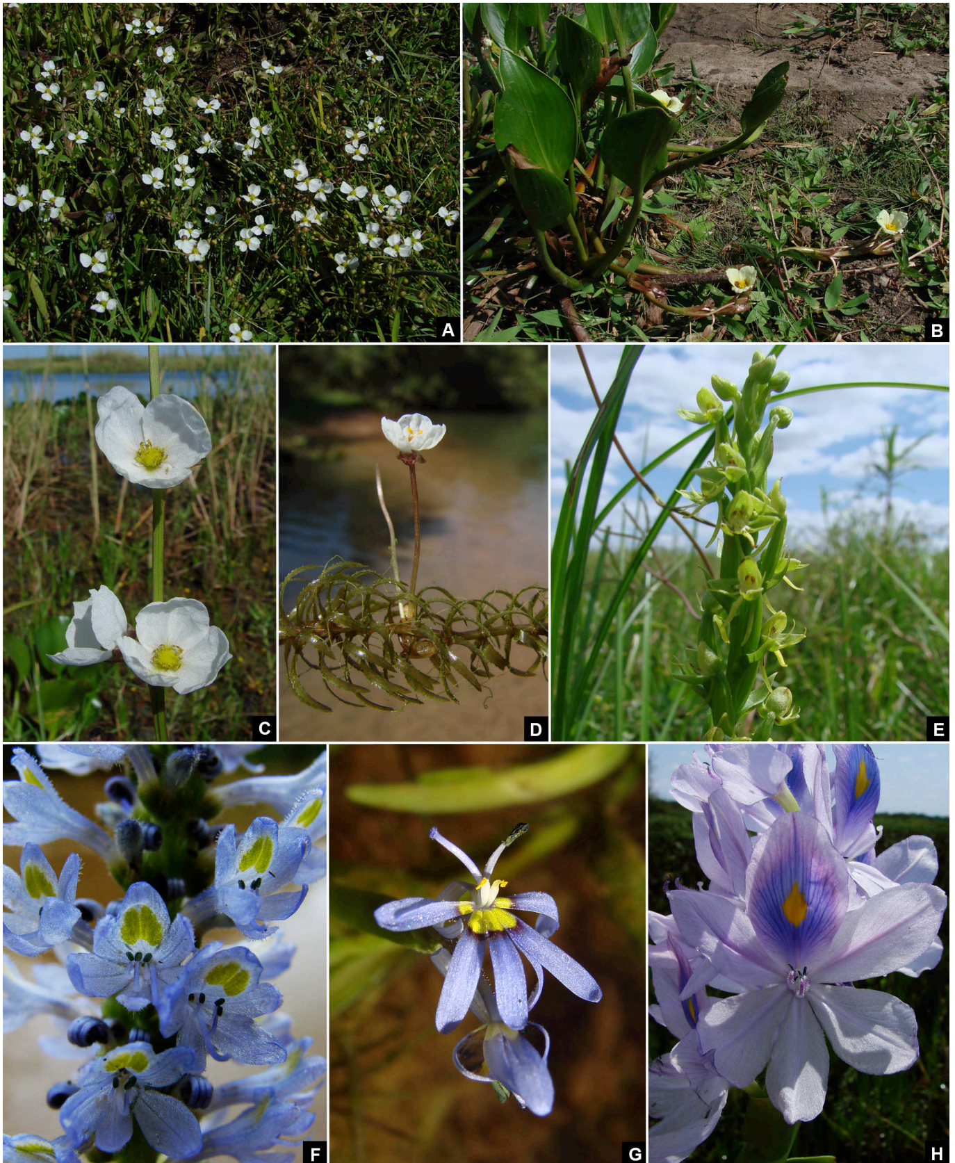
FIGURE 4. Aquatic macrophyte species photographed at the Pandeiros River Wildlife Sanctuary: Monocotyledons. A. Helanthium bolivianum (Alismataceae), B. Sagittaria rhombifolia (Alismataceae), C. Echinodorus paniculatus (Alismataceae), D. Egeria najas (Hydrocharitaceae), E. Habenaria repens (Orchidaceae), F. Pontederia cordata (Pontederiaceae), G. Hydrothrix gardneri (Pontederiaceae), H. Eichhornia crassipes (Pontederiaceae).