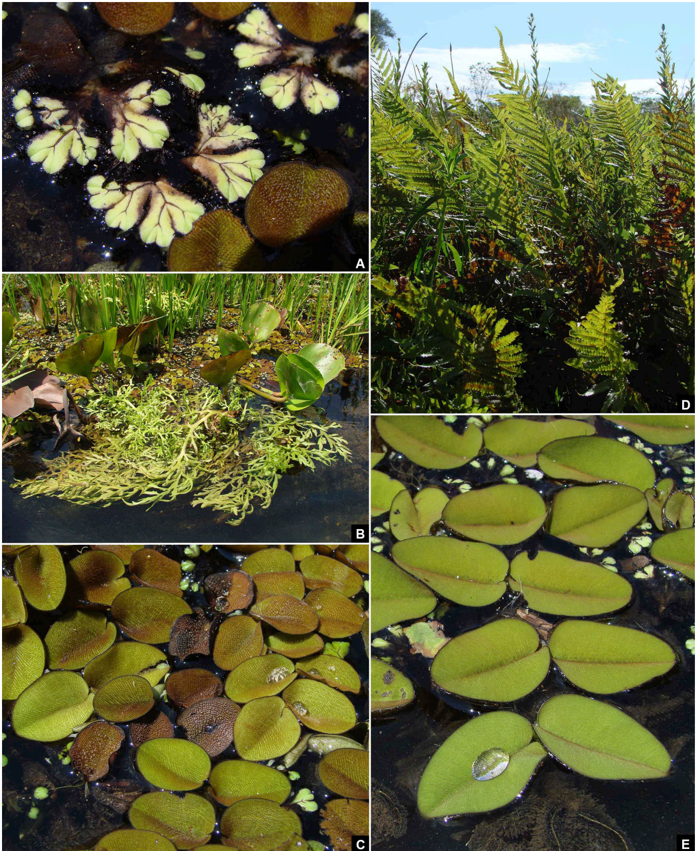
FIGURE 2. Aquatic macrophyte species photographed at the Pandeiros River Wildlife Sanctuary: Liverworts and ferns. A. Ricciocarpus natans (Ricciaceae), B. Ceratopteris pteridoides (Pteridaceae), C. Salvinia auriculata (Salviniaceae), D. Thelypteris interrupta (Thelypteridaceae), E. Salvinia oblongifolia (Salviniaceae).