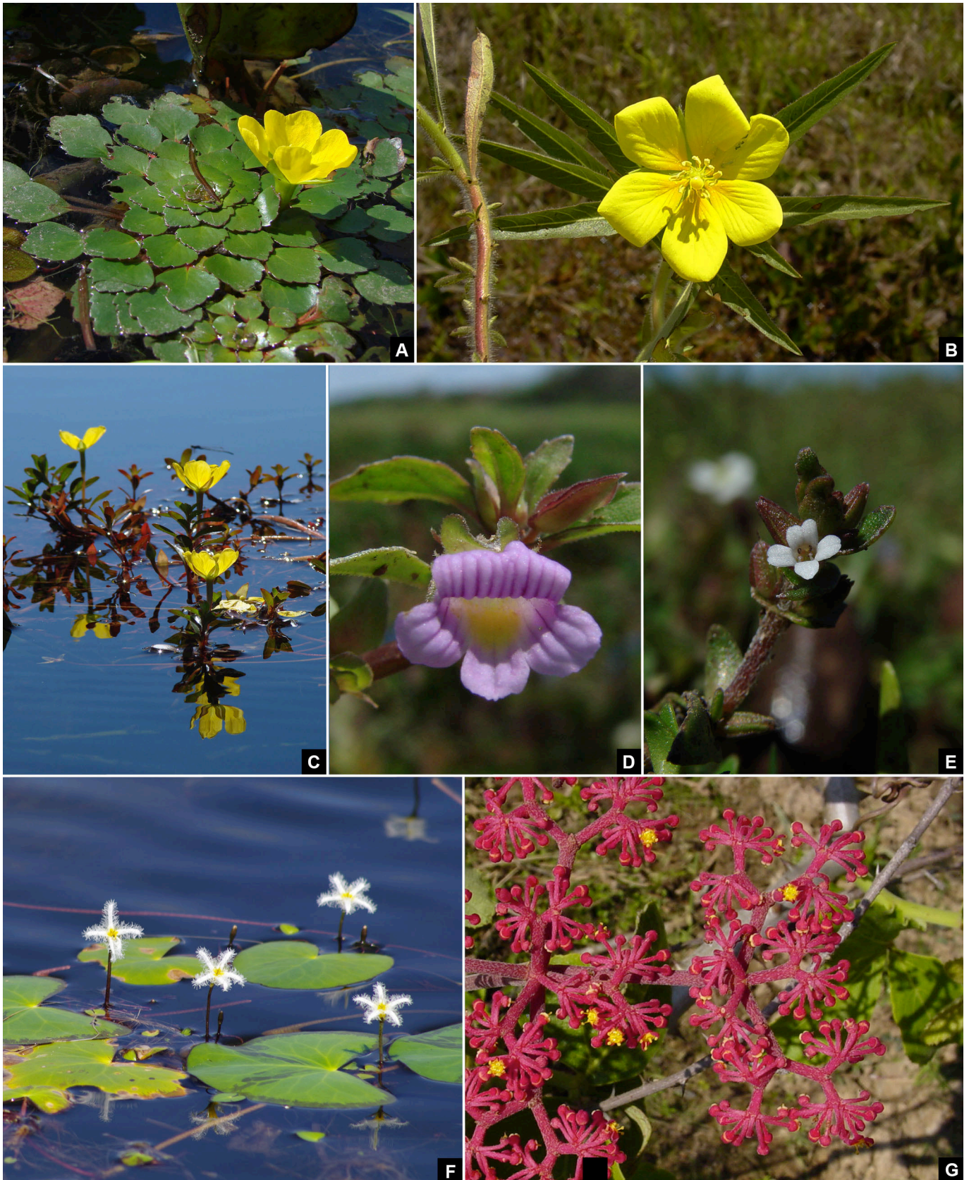
FIGURE 6. Aquatic macrophyte species photographed at the Pandeiros River Wildlife Sanctuary: Eudotyledons. A. Ludwigia sedoides (Onograceae), B. Ludwigia leptocarpa (Onograceae), C. Ludwigia inclinata (Onograceae), D. Cuphea racemosa (Lythraceae), E. Bacopa monnierioides (Plantaginaceae), F. Nymphoides indica (Menyanthaceae), G. Cissus spinosa (Vitaceae).