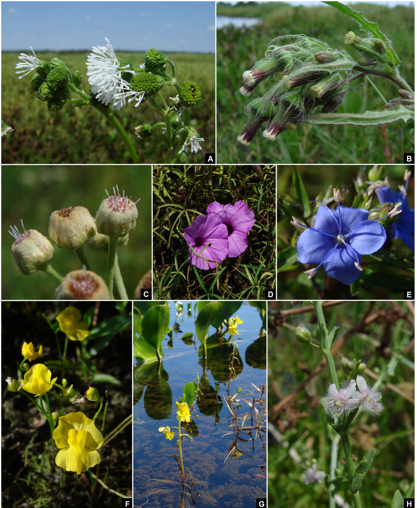
FIGURE 5. Aquatic macrophyte species photographed at the Pandeiros River Wildlife Sanctuary: Eudotyledons. A. Gymnocoronis spilanthoides (Asteraceae), B. Erechites hieraciifolius (Asteraceae), C. Pluchea sagittalis (Asteraceae), D. Ipomoea sp. (Convolvulaceae), E. Hydrolea spinosa (Hydroleaceae), F. Utricularia gibba (Lentibulariaceae), G. Utricularia foliosa (Lentibulariaceae), H. Scoparia dulcis (Plantaginaceae).