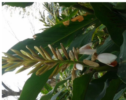
Fig. 2: Alpinia blepharocalyx var. glabrior (Handel-Mazzetti) T. L. Wu