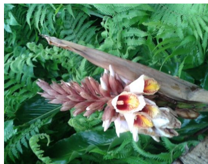
Fig. 4: Alpinia kwangsiensis T. L. Wu & S. J. Chen