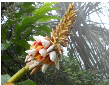
Fig. 1: Alpinia blepharocalyx K. Schumann var. blepharocalyx T.L.

Wu, D., Larsen, 2000. Flora of China, Vol. 24, pp. 322-377.