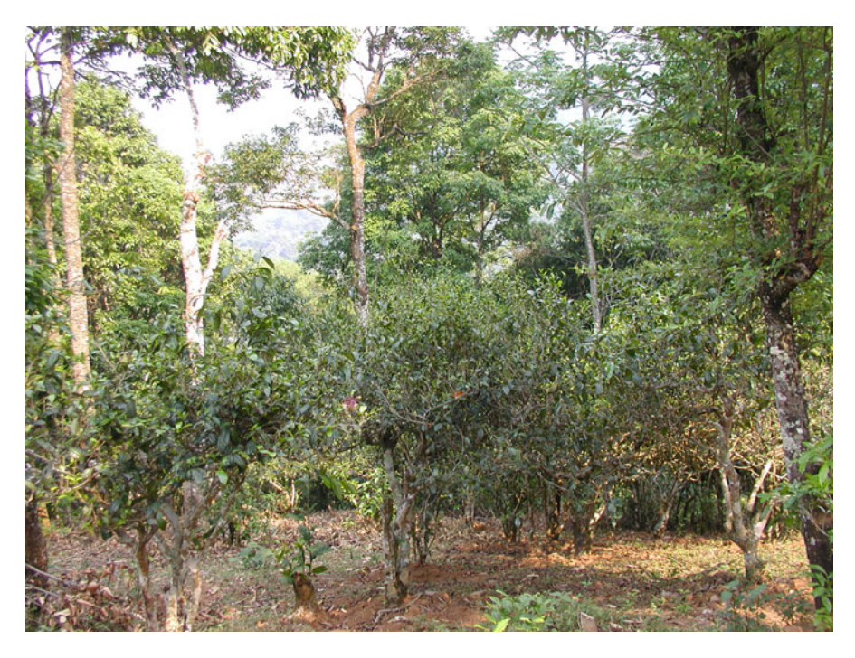
Fig. 1 Photo of ancient tea garden community

Many species in the ancient tea garden can be used effectively (Fig. 2). According to 18 sampled house-holds ancient tea gardens, there are 386 species altogether, and 216 of which is utilized (56.0 %) and 29.7 % of individuals are used (Table 6). While the