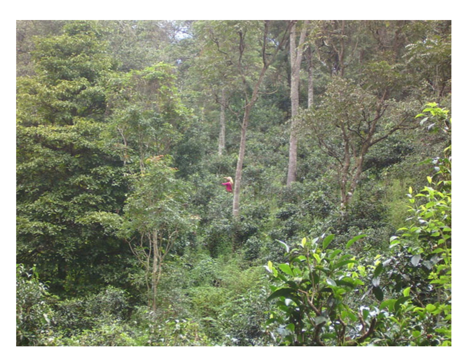
Fig. 2 Photo of local people pick tea tree-leaves in ancient tea garden

From the diversity index of the sample households, the economic value of the biological resource in ancient tea garden exceeded that of normal tea gardens. The market value of non-tea utilized species in ancient tea