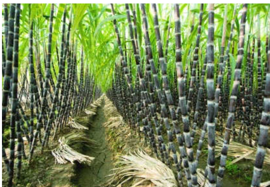
Figure 1: Sugarcane plantation

Saccharum or sugarcane is a genus of tall perennial grass with 6 species and as many as 37 hybrids. The origin of these species are from south Asia and south East Asia, New Guinea being the most probable according to archeological evidence (6000 BC), S.officinarum and S.edule owe their genetic evidence to the country, from where it is thought to have spread to mainland Asia through human migration. India on the other hand has had a very long history of sugarcane production, at least 3500 to 4000years. The Artha Veda (1500 BC) has the earliest reference to the crop, as ' iksha ' and S.barberi certainly has its origin in the Indian subcontinent. It is here that the production of processed sugar by boiling the cane juice was discovered in the first millennium BC.