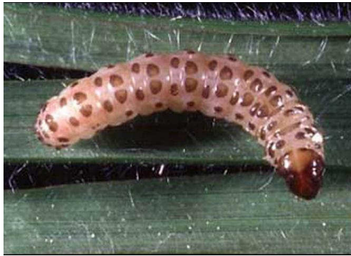
Figure 4: Mature sugarcane larvae

Eggs are deposited on both upper and lower surface of the leaves, either singly or in clusters of 50, in an overlapping fashion i.e. fish scales or roof tiles. The eggs are 1.2 mm in length and 0.8 mm in width, usually whitish when deposited, slowly turning reddish or dark brown when close to hatching. The eggs hatch in 4 – 9 days.