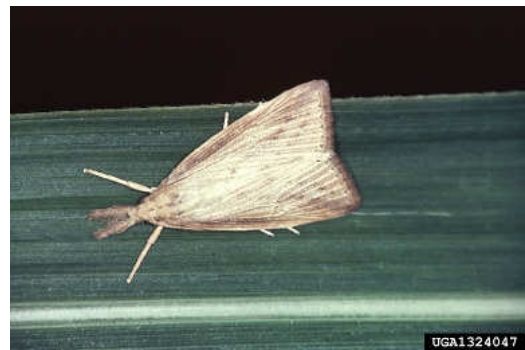
Figure 3: Sugarcane borer

Sugarcane borer is native to the western hemisphere but seems to have been introduced to the United States of America (USA), where it inhabits the warmer states. It is also found through the Caribbean, warmer parts of South America, including Argentina and Brazil. It belongs to the order of Lepidoptera and the family of Pyralidae, it is a average size moth.