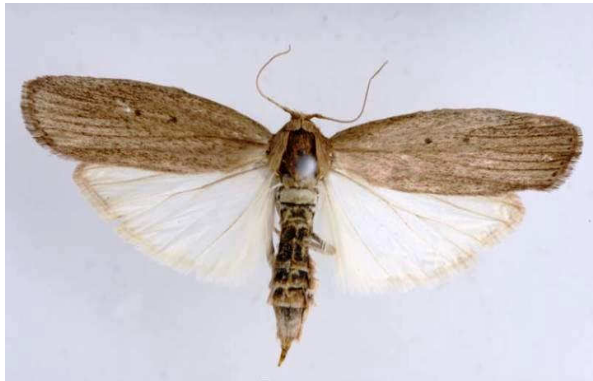
Figure 5: Adult sugarcane moth ( http://www.padil.gov.au )

a) in warm conditions the sugarcane borer can complete its life cycle within 25 days, however in cool conditions it may last up to 200 days.