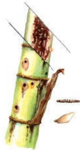
Figure 6: Stem borer tunneling in sugarcane

Tunnelling weakens the plants, thus causing it to lodge, in mature plants the top may die off or break off'. It may also cause loss of stalk weight (tonnage/acre) but the greatest threat posed by the stem borer is the reduction in yield of sucrose quantity and quality, 10 – 20% loss in sucrose quantity can be expected from infested plantation.