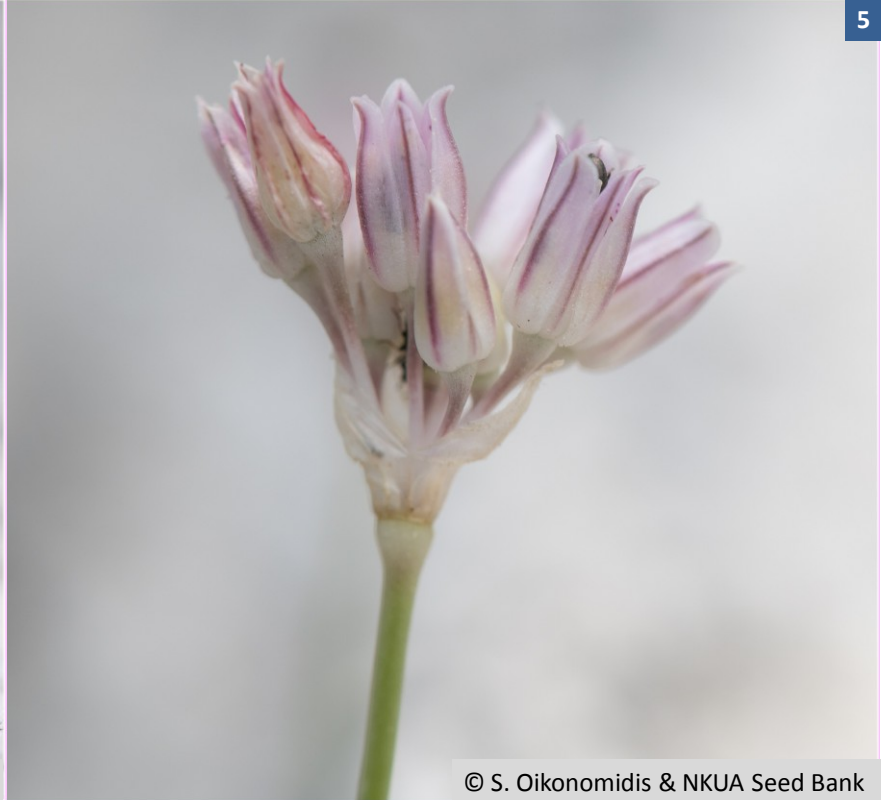
© S. Oikonomidis & NKUA Seed Bank