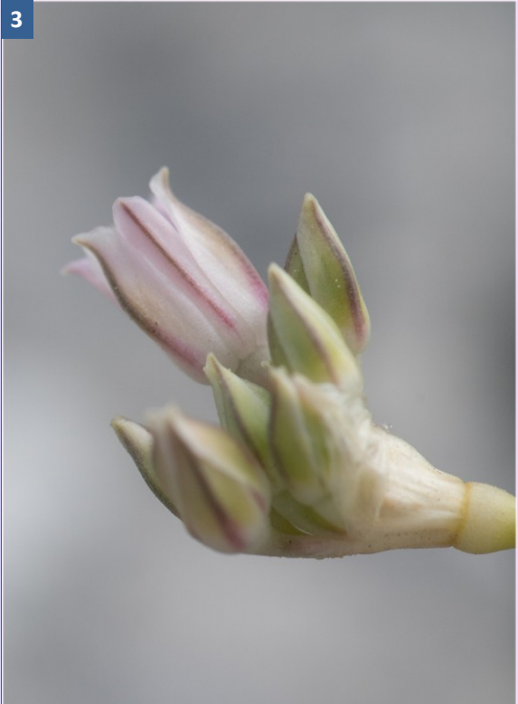
© S. Oikonomidis & NKUA Seed Bank