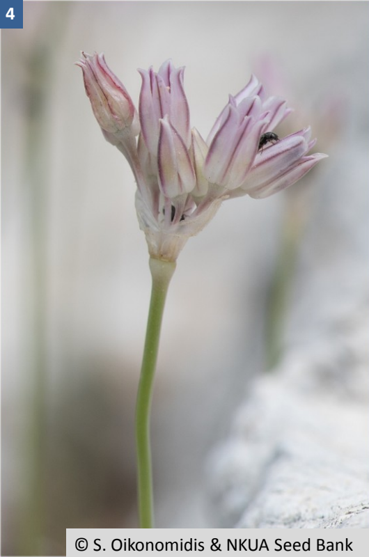
© S. Oikonomidis & NKUA Seed Bank