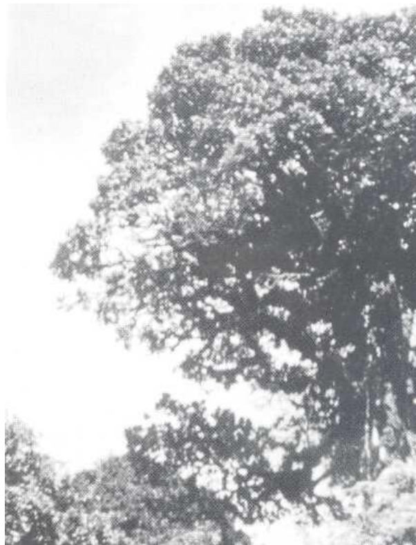
Fig. 4. Sixty-foot old tree of Persea vesticula in San Juancito mountains, Honduras, 1954.