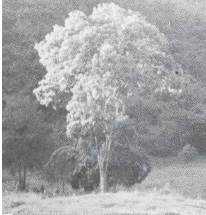
Fig. 3. Fifty-foot tree of Aguacate Mico (Persea tolimanensis) growing on side of Volcano Santa Ana in El Salvador, 1975.