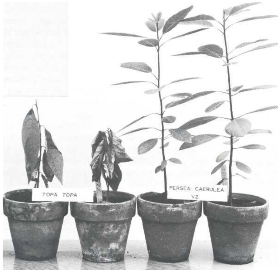
Fig. 2. Seedlings of Persea caerulea from Venezuela growing vigorously in soil infested with Phytophthora cinnamomi, compared with Topa Topa seedlings. P. caerulea proved to be not graft compatible with avocado.