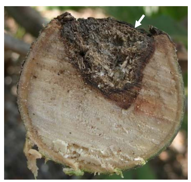
Fig 3. Dothiorella perennial canker on branch

According to preliminary results from a continuing survey throughout avocado growing areas of California, multiple species of Botryosphaeria ( Neofusicoccum australe, B. dothidea, N. luteum , and N. parvum ) were found.