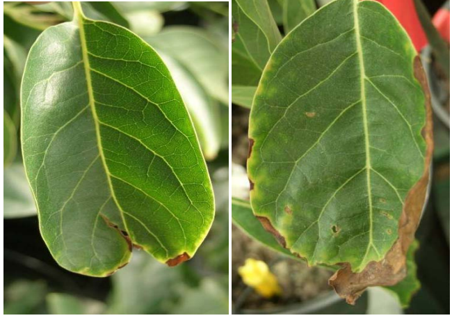
Fig 6. Leaf scorch symptoms of Dothiorella canker

Pathogenicity tests were conducted in the greenhouse on 1-year-old avocado seedlings, Hass cv., with one randomly chosen isolate from each of the Botryosphaeriaceae species noted above. Four replicate seedlings were stem-wound inoculated with a mycelial plug and covered with Parafilm. Sterile PDA plugs were applied to four seedlings as a control. Over a period of 6 months, seedlings were assessed for disease symptoms that included browning of leaf edges and shoot dieback. Mean vascular lesion lengths on stems were 64, 66, 64, and 18 mm for B. dothidea, N. parvum, N. luteum, and N. australe, respectively. Each fungal isolate consistently reisolated from inoculated seedlings, thus completing the pathogenicity test. To our knowledge, this is the first report of N. australe, N. luteum, and N. parvum recovered from branch cankers on avocado in California.