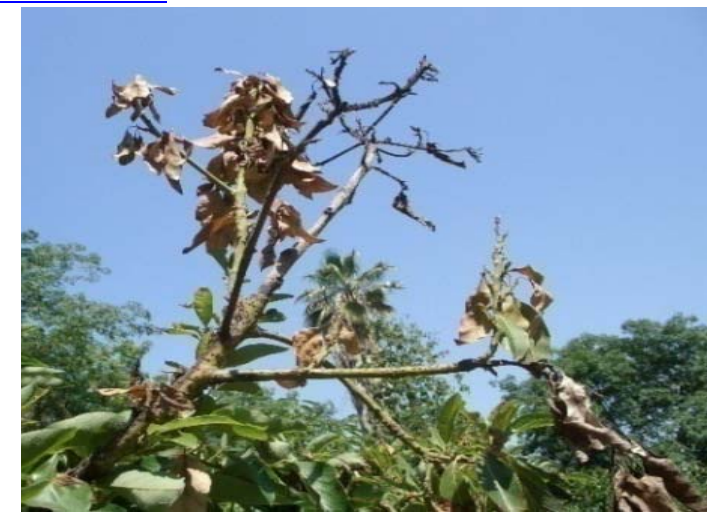
Fig. 2. Dothiorella branch and shoot dieback symptoms on Hass cv. avocado tree.

However, recent studies based on DNA analyses suggest greater species diversity of this pathogen group than based on morphological characteristics alone. Thus far, multiple species Botryosphaeriaceae have been found to cause the typical Dothiorella canker (Fig 3, 4) and stem-end rot (Fig 5), leaf scorch (Fig.6) on avocado in California. Percent recovery of Botryosphaeria spp. based on morphological characters ranged from 40-100% in Riverside county, 42-53% in Ventura county, 33% in Santa Barbara county, 60% in San Diego county and 32-60% in San Luis Obispo county.