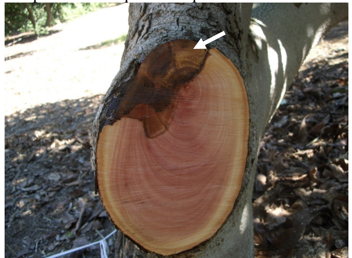
Fig 4. Dothiorella perennial canker on trunk

old diseased avocado tree branches. Sequenced rDNA fragments (ITS1, 5.8S rDNA, ITS2, amplified with ITS4 and ITS5 primers) were compared with sequences deposited in GenBank.