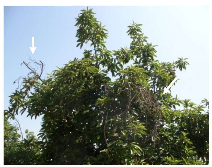
Fig. 1. Dothiorella branch dieback and canker symptoms on Hass cv. avocado tree.

Branch and trunk canker on avocado was formerly attributed to Dothiorella gregaria , hence the name Dothiorella canker. So far Botryopshaeria dothidea (anamorph: Fusicoccum aesculi ) is the only known species causing Dothiorella canker on avocado in California. Symptoms observed on avocado with Dothiorella canker include shoot blight and dieback, leaf scorch, fruit rot, and cankers on branches and bark (Fig.1, 2, 3).