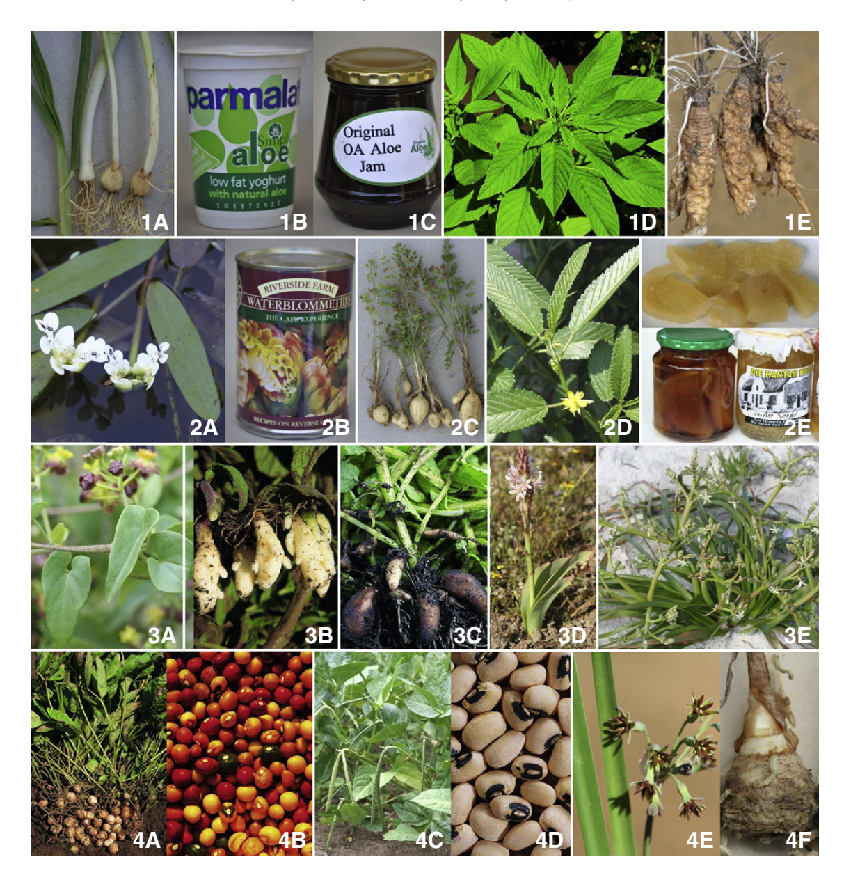
Fig. 1. Examples of South African indigenous fruits with commercial potential for developing new crops and new products (edible fruits, dried and processed fruits, fruit juices, heath products, jams, chutneys, sweets, fruit flavours and liqueurs). 1A–C, Adansonia digitata —baobab (1A, leaves and flower; 1B, fruits and seeds; 1C, aloe gel drink containing baobab); 1D, Berchemia discolor —brown ivory; 1E, Carissa macrocarpa — amatungulu ; 2A–B, Carpobrotus edulis —sour fig (2A, ripe fruit; 2B, dried fruit); 2C, Citrillus lanatus —tsama melon; 2D, Cucumis metaliferus ;—jelly melon; 2E, Cucumis zeyheri —wild cucumber; 3A, Diospyros mespiliformis —jackal-berry; 3B–C, Dovyalis caffra —Kei-apple (3A, fruits; 3B, liqueur); 3D, Manilkara mochisia —lowveld milkberry; 3E, Mimusops zeyheri —red milkwood; 4A–C, Sclerocarya birrea —marula (4A, ripe fruits; 4B, marula sweets; 4C, marula liqueur); 4D, Solanum retroflexum —msoba (fruits and jam); 4E, Vangueria infausta —wild medlar.

for new product development. A wide diversity of products can be derived from fruits; they can be eaten fresh or dried, processed into sweets, fruit juices, jams, jellies, chutneys, vinegars, wines, liqueurs and novel flavours. The seeds are often edible as nuts or contain valuable oil for culinary or cosmetic uses, as noted long ago by Schweikerdt (1937) and reviewed by Viljoen, 2011b-this issue. Innovative processing may allow the use of fruits that are currently considered too small to be of any commercial interest, despite their delicious taste (such as Grewia flava and Osteospermum moniliferum ). The value of indigenous fruits in traditional fermented drinks ("beers") is discussed later on.