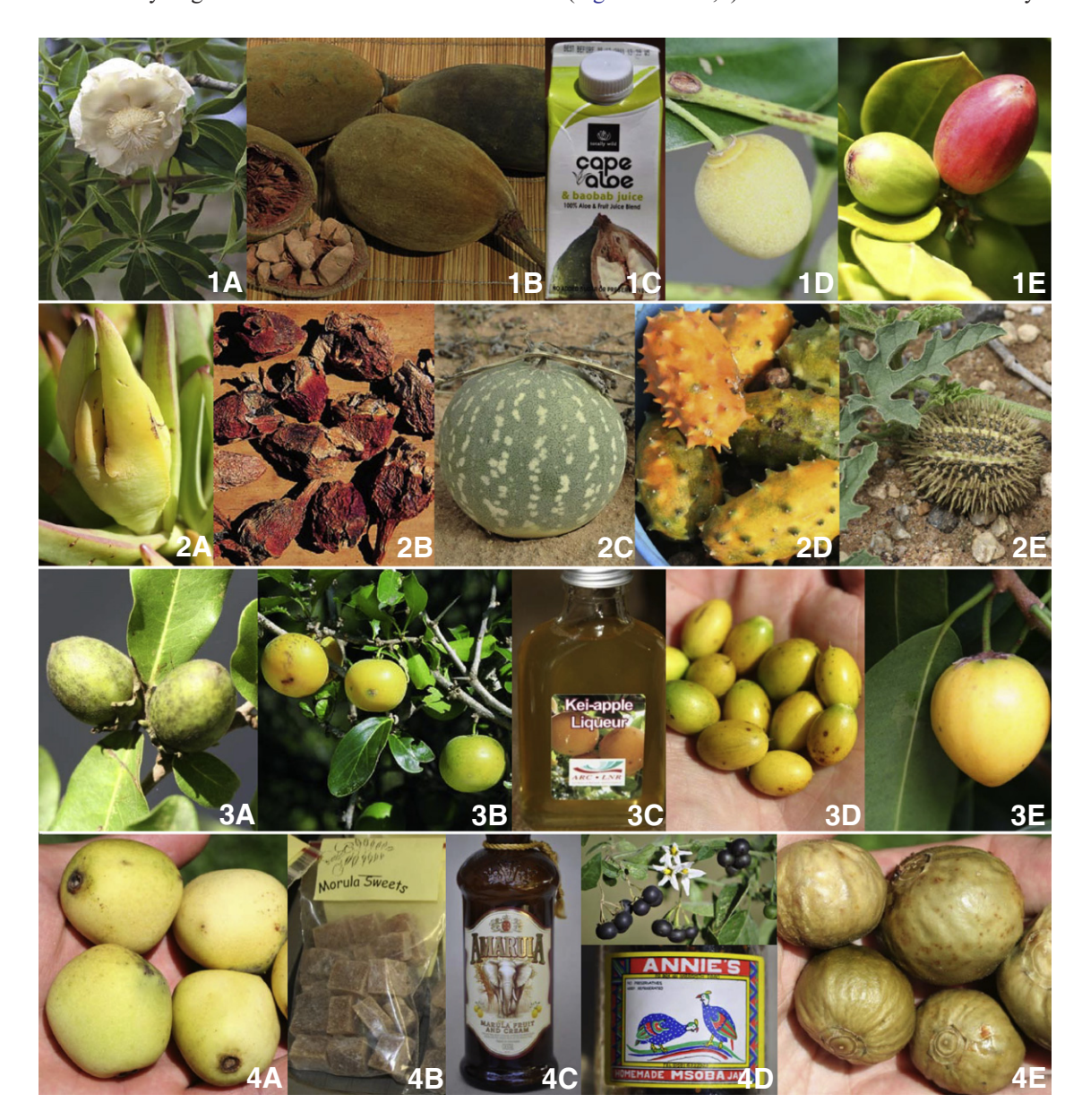
Fig. 2. Examples of South African indigenous vegetables and pulses with commercial potential for developing new crops and new products (leafy vegetables, root vegetables, culinary herb and snack foods). 1A, Allium dregeanum —wild leek; 1B–C, Aloe ferox —Cape aloe (1B, yoghurt containing aloe gel; 1C, aloe jam); 1D, Amaranthus species— marogo ; 1E, Annesorhiza nuda —anise root; 2A–B, Aponogeton distachyos — waterblommetjie (2A, leaves and flowers; 2B, canned product); 2C, Chamarea species— vinkelwortel ; 2D, Corchorus tridens — ligusha ; 2F, Fockea species— kambro (traditional jam); 3A, Pentarrhinum insipidum — leshwa ; 3B, Plectranthus esculentus —wild potato, Livingstone potato; 3C, Solenostemon rotundifolius —Zulu round potato; 3D, Trachyandra falcata —wild cabbage, veldkool ; 3E, Trachyandra divaricata —dune cabbage, duinekool ; 4A–B, Vigna subterranea —jugo bean (4A, plant with pods; 4B, seeds); 4C–D, Vigna unguiculata —cowpea (4A, plant with pods; 4B, seeds); 4E–F, Tulbaghia capensis —Cape wild garlic (4E, leaves and flowers; 4F, dormant bulb).

waterblommetjies (Aponogeton distachyos) which is available as a canned product (Fig. 2 and A,B) and nowadays served at restaurants offering traditional Cape quisine. Recipes for the traditional stew can be found in Coetzee (1977), Leipoldt (1976) and Rood (1994, 2008). Another typical Cape stew is made from the young inflorescences of Trachyandra species (Figs. 2 and 3D,E), including T. falcata (wild cabbage, veldkool ), T. divaricata ( strandkool ), T. ciliata (L.f.) Kunth ( veldkool ) and T. hispida (L.) Kunth. (hairy veldkool ). Recipes are given by Leipoldt (1976, 1978) and Rood (1994, 2008). Allium dregeanum (wildeprei or wild leek) (Figs. 2 and 1A) and Tulbaghia species (wild garlic) (Figs. 2 and 4E,F) are sometimes used as culinary herbs. It may