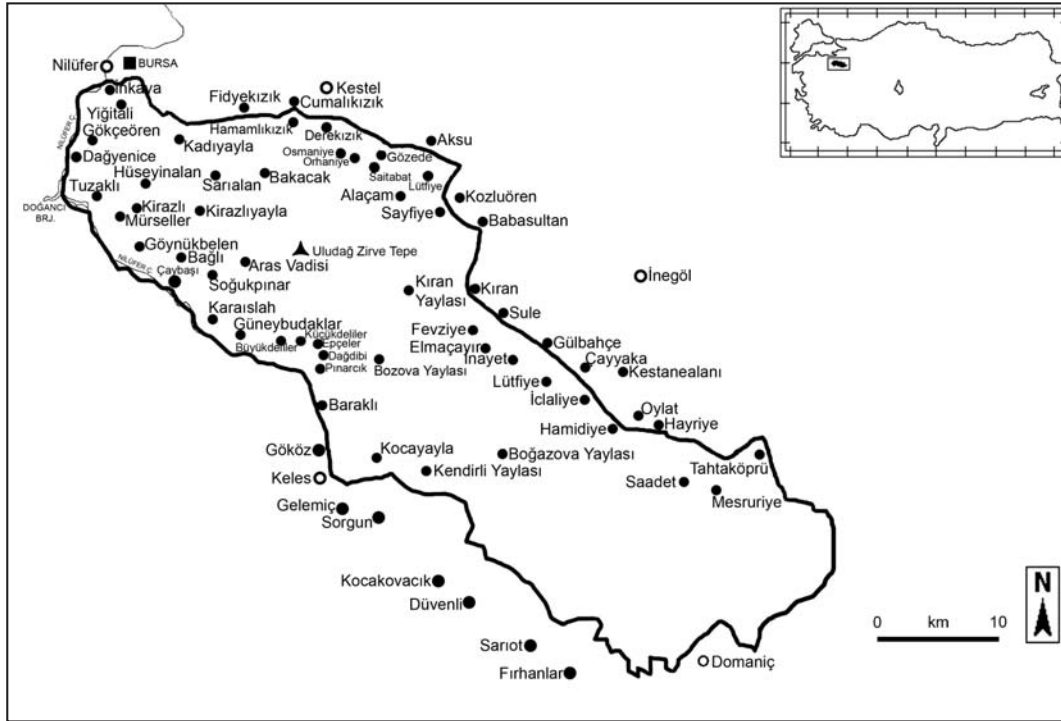
Fig. 1. Map of the Uludag Mt.