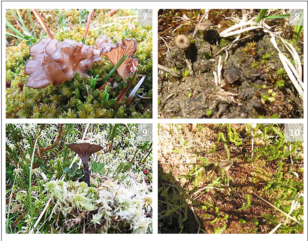
Fig. 7. Arrhenia lobata – basidiomata; Fig. 8. Arrhenia obatra – basidioma; Fig. 9. Arrhenia onisca – basidioma; Fig. 10. Arrhenia sphagnicola – basidioma.

Pileus 1–2.5 (3) cm in diameter, initially convex and slightly depressed in the center, subsequently infundibuliform, hygrophanous, ochre-brownish, light-brown, beige-brown, with dark-brown scales, margin involute for a long time. Gills broad, decurrent, ochraceous to pale-brownish. Stipe 2–5 × 0.3–0.5 cm, cylindric, smooth, ochre-brown, tomentose towards the base. Context thin, pale-brownish. Smell indistinctive. Basidia clavate, 4-spored, with basal clamp. Basidiospores 8–12.5 × 4–5 μm, ellipsoid to cylindric, variable, smooth, hyaline. Pileipellis consisting of brown, incrustated, parallel to irregular hyphae, septa with clamp connection.