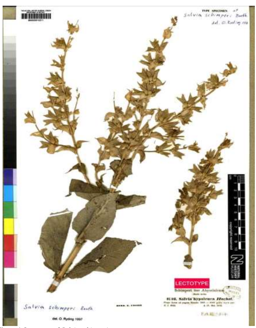
Figure 4. Lectotype of Salvia schimperi