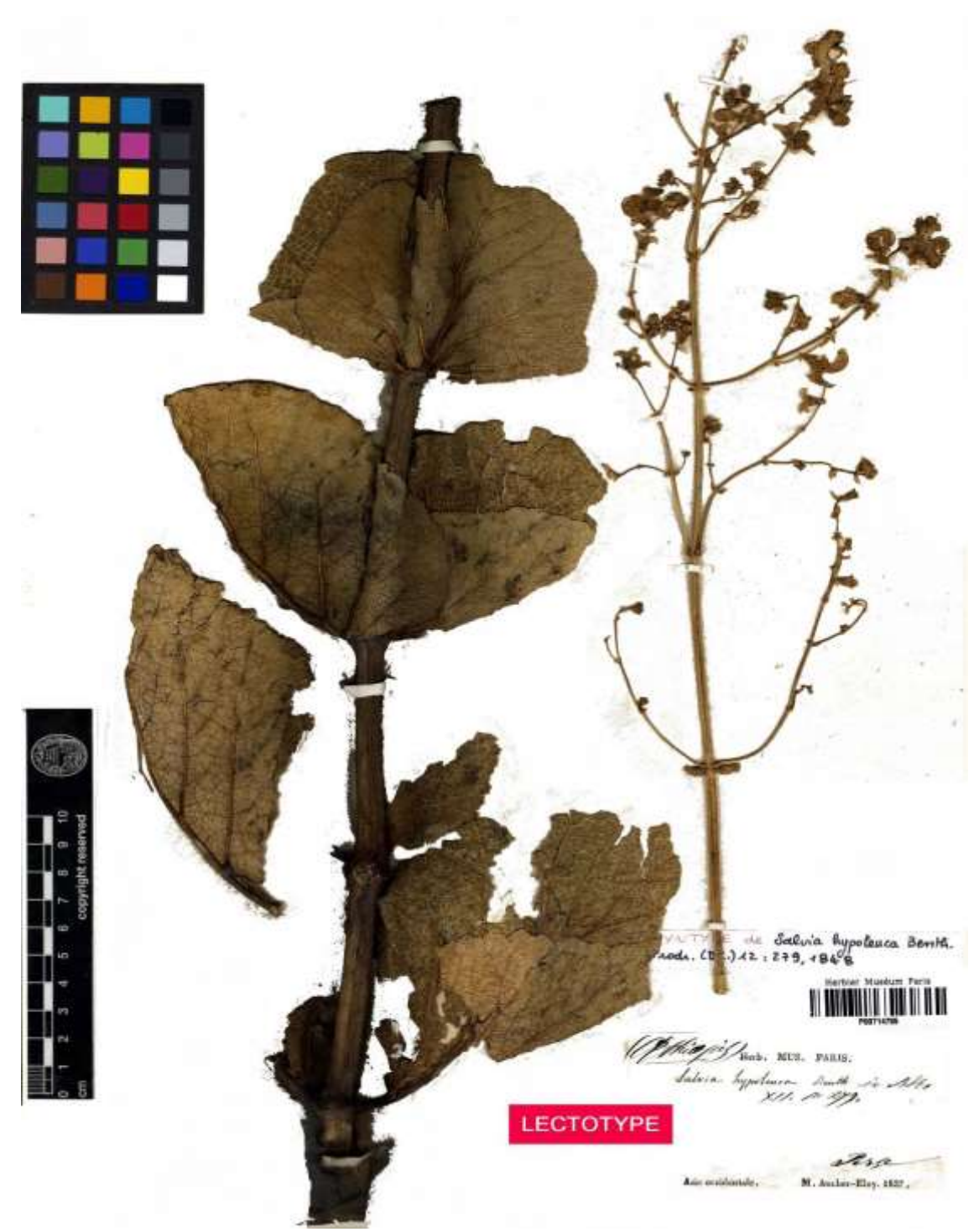
Figure 3. Lectotype of Salvia hypoleuca