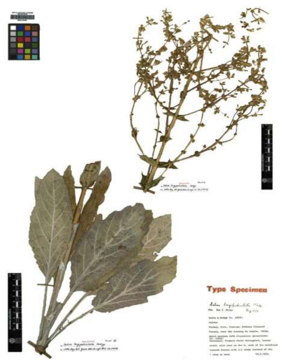
Figure 2. Holotype of Salvia longipedicellata (up: sheet I, down: sheet II)