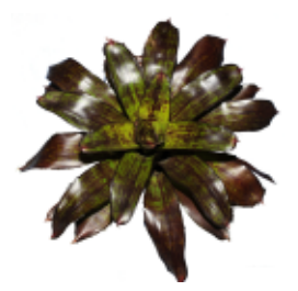
Neoregelia 'Lime and Lava' Reserve Champion