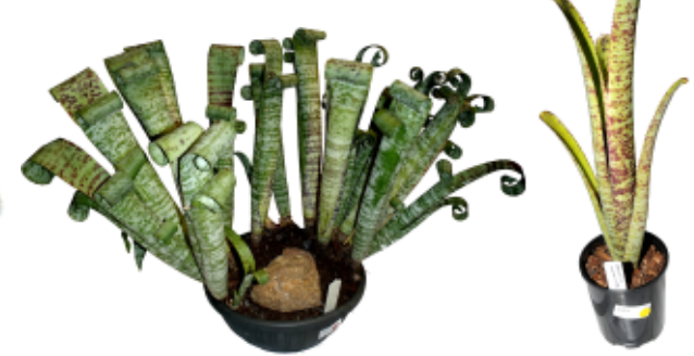
Quesnelia 'Tim Plowman'