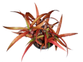
xNeophytum 'Galactic Warrior'