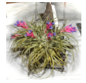
Tillandsia stricta x aeranthos