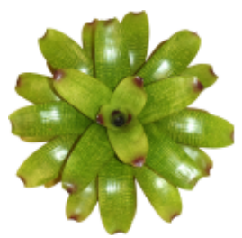
Vriesea hieroglyphica x platynema