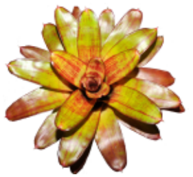
Neoregelia 'Jewellery Shop'