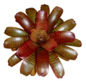
Vriesea 'Red Emperor'