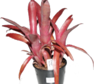
Billbergia 'Ruby Eyes'