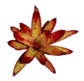
Neoregelia 'Golden Jewels'