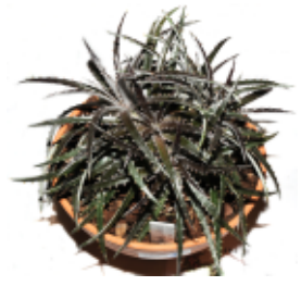
Dyckia 'Ruby Ryde'