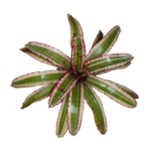
Neoregelia 'Bottoms Up'