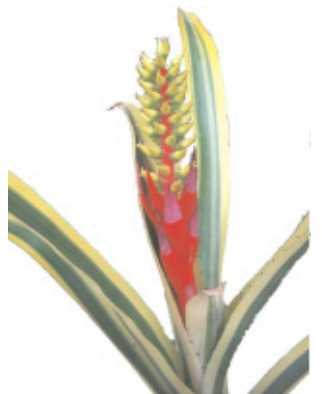
Aechmea nudicaulis albo-marginata

Ae. nudicaulis has been grown outside of Sth. America for hundreds