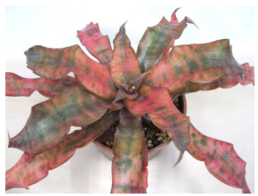
Cryptanthus 'McIntosh' 1st Novice Les Higgins