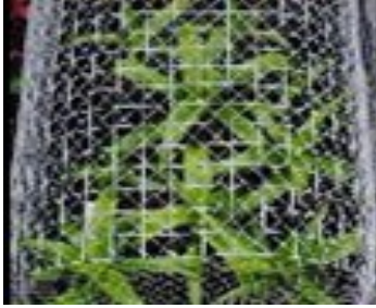
Seedlings may need protection from marauding grasshoppers.