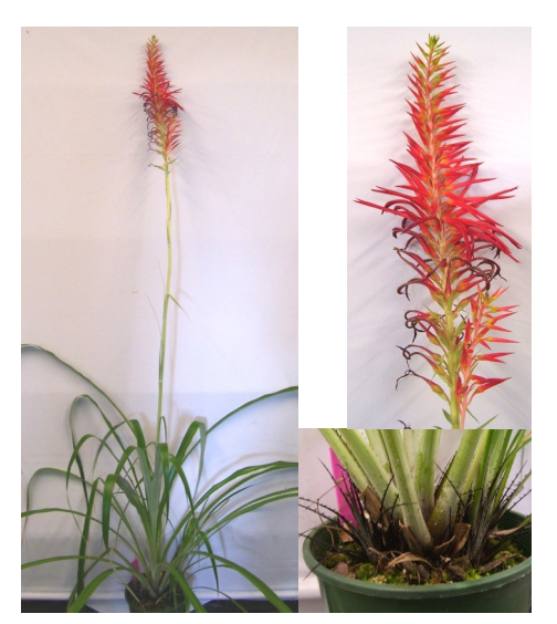
Pitcairnia integrifolia flwrs to1mtr high, alt. to 500 m., Brazil (?), northeastern Venezuela, northern Trinidad.