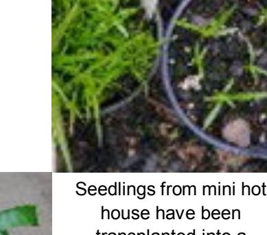
house have been transplanted into a community pot