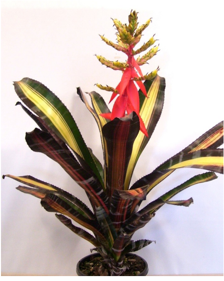
Aechmea 'Roberto Menescal' is a tissue-cultured sport of a dark form of Ae. chantinii