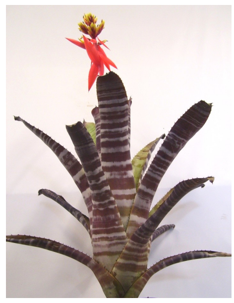
Aechmea 'Dark Goddess' is a cultivar of Ae. chantinii