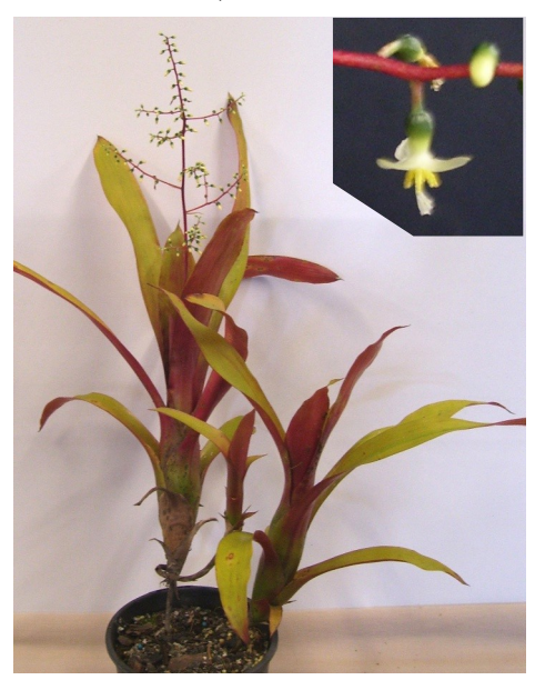
Araeococcus parviflorus flwrs to 45cm high, terrestrial and epiphytic in low woods, 30-100 m alt, Bahia, Brazil.