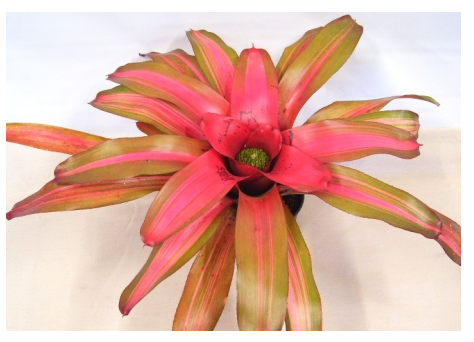
Neoregelia 'Imperfecta' grown by Laurie Mountford