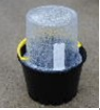
Squat pot with clear plastic container fitted to make a mini hot house

The general growth rates for Aechmeas, Hohenbergias, Neoregelias and Nidulariums are much faster than that of Tillandsias, Vrieseas, Alcantareas, Araeococcus and Werauhias that I have grown.