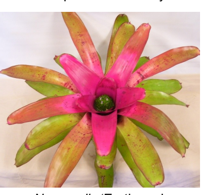
Neoregelia 'Earthrose' grown by Flo Danswan