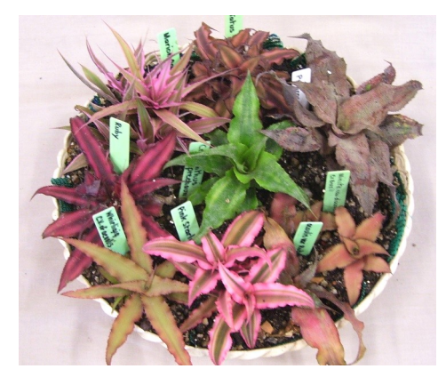
■ Jill Ash Les Higgins ▲ Decorative entries grown by