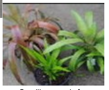
Seedlings ready for hardening off to regular climatic conditions.