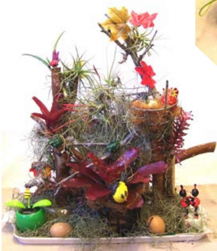
Two photos ↔ to show both the front and back of Coral McAteer's 1st place Decorative entry this month.