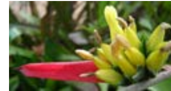
Aechmea disjuncta