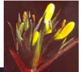
Aechmea atrovittata Elton Leme 6519