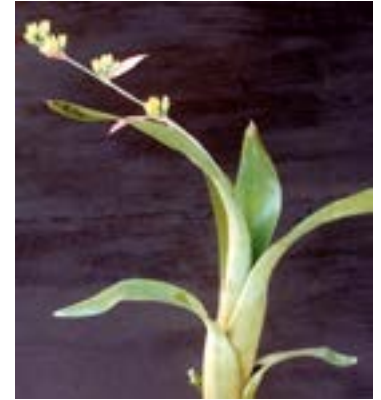
Aechmea disjuncta

Aechmea disjuncta is endemic to low montane Atlantic forest in Bahia. It forms large clumps as an epiphyte in the canopy, or more rarely it is rupicolous, especially at higher elevations.”