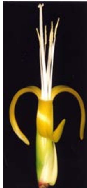
A typical Alcantarea flower with long, narrow, spiralling petals. These will emerge from each of the branches of the inflorescence.