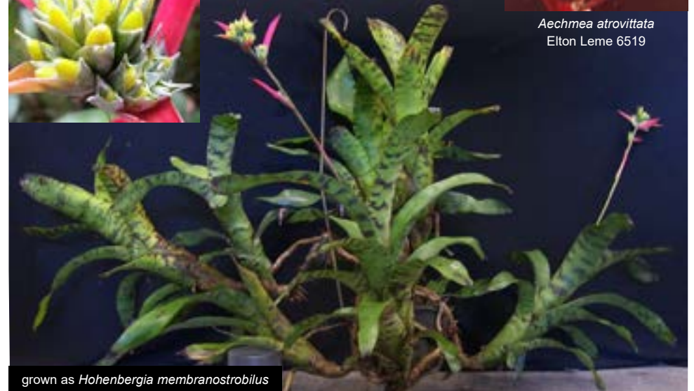
grown as Hohenbergia membranostrobilus