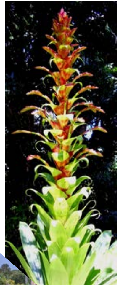
Alcantarea 'Whyanbeel' 3.50 m tall.