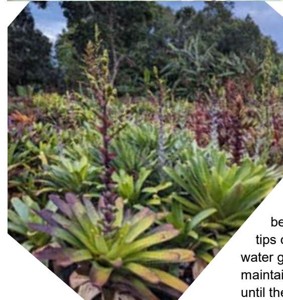
Alcantarea 'Pedra Azul'

As with any tree, shrub or Bromeliad when being relocated from a protected area into a more brightly lit position the plants hydration must be considered. Burnt or dried leaf tips can be the result of insufficient water gain by the leaves. It is important to maintain a consistent watering program until the plant/s are established and show signs of healthy new growth.