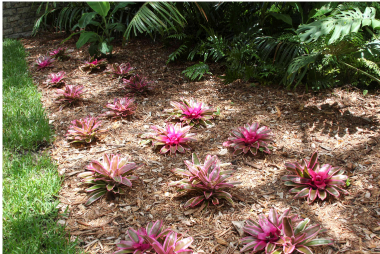
These Neoregelia 'Franca' provide a burst of hot pink for this homeowner. They are under a canopy of oaks and receive quite a bit of shade. Notice the spacing which allows the garden observer to see the full shape of the plant and provides space for pups.