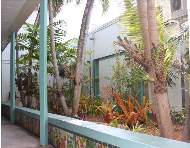
These Aechmea orlandiana 'Bert' were placed on existing palms by Palmetto Middle School students