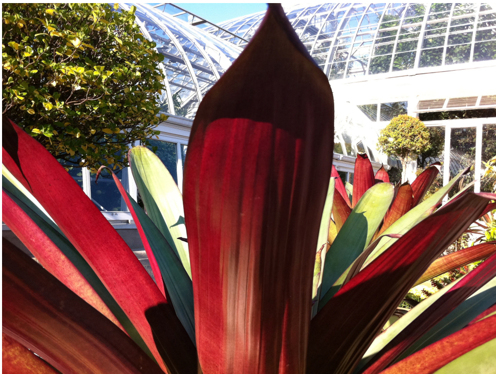
This Alcantarea imperialis is in a container at the New York Botanical Garden. Just look at the majestic color of its foliage!