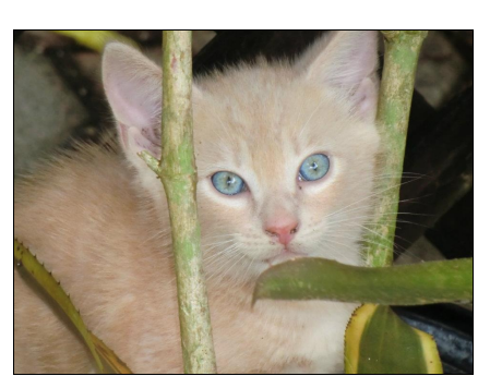
My bromeliad's pup was a kitten.

Caloosahatchee Bromeliad Society Show and Sale Terrie Park 3451 Marion Street, Fort Myers