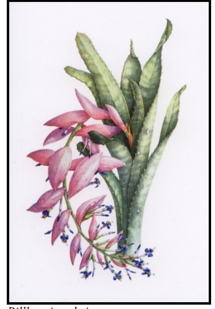
Billbergia zebrina D. Bilderbeck-Frost

Awards Barbara Sparling - maintain inventory or ribbons and crystal, buying enough to cover show needs, setting up major award winners on the head table after judging is concluded, breaking down the