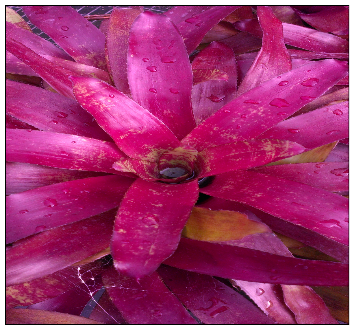
Neoregelia 'Bob Work'