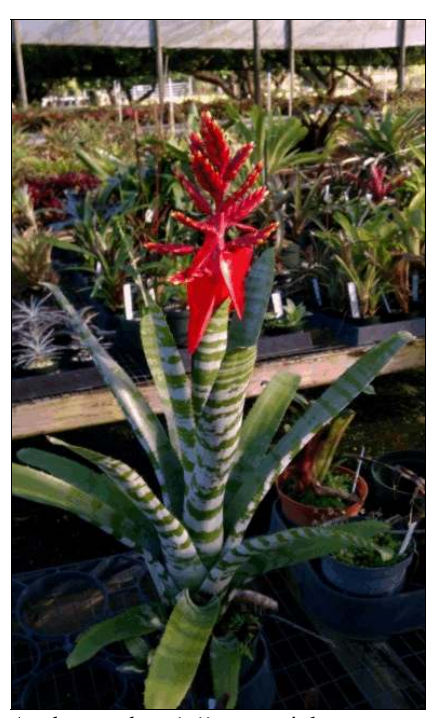
Aechmea chantinii v. special hummingbird attractor

Hummingbirds have returned to our area. I had the privilege of watching three of these little demons fighting over access to a particular