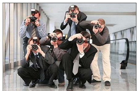
Group photo will be December 18, 2012

They pulled into a local restaurant, and she ran to the lavatory to text Candy and followed up with a call. No answer from the call. and unknown to her was the receipt of the text. But, she had delivered proof of attempt to communicate, and could rest easier.