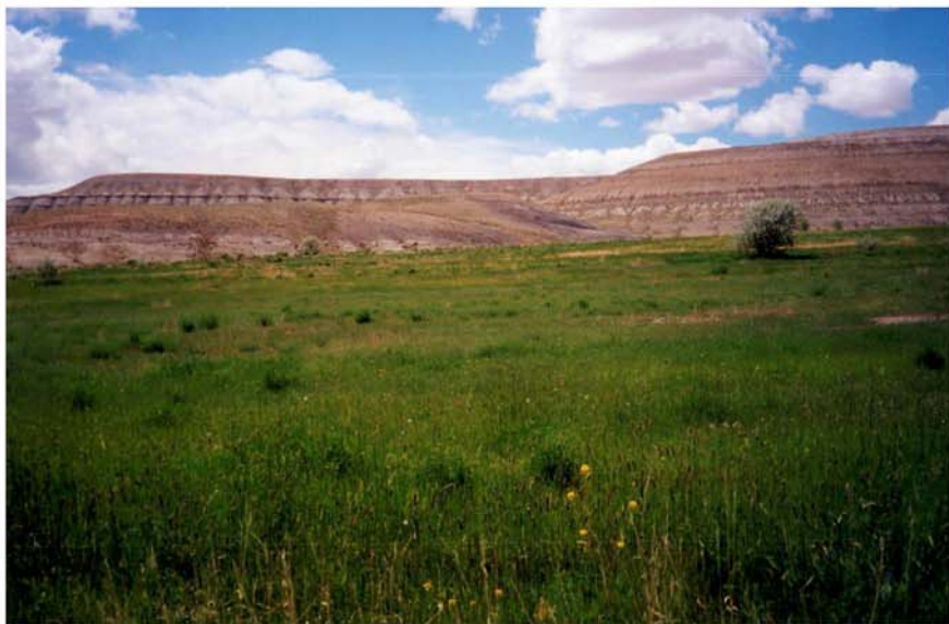
Where the deer and antelope roam