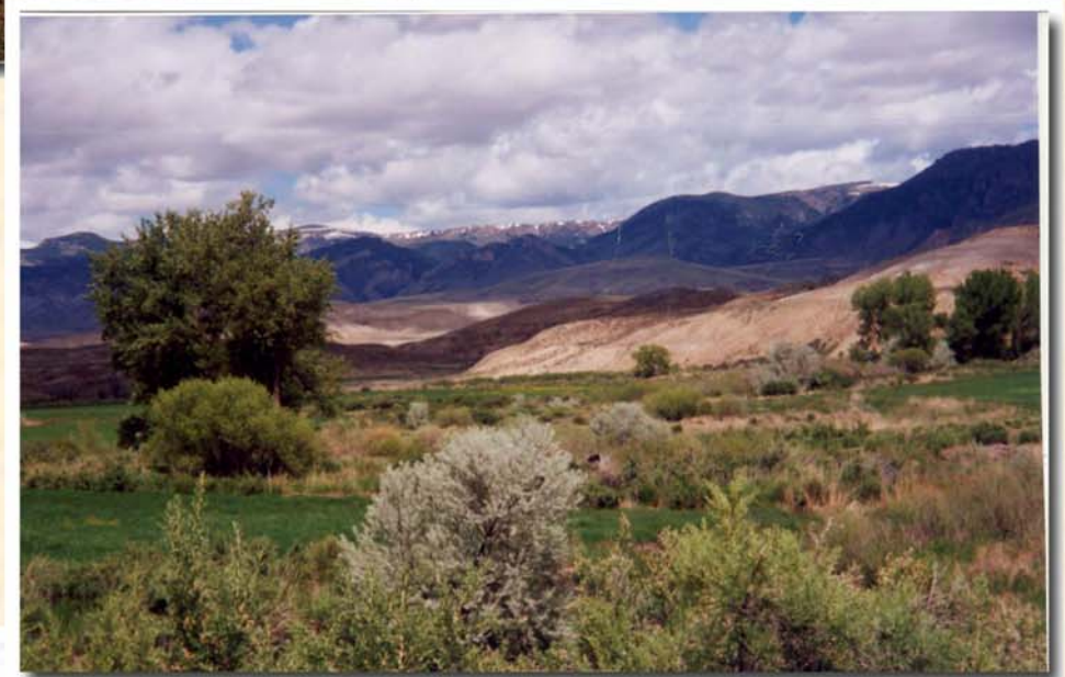
Beaver Creek meanders through the valley.