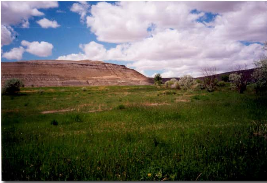
Wide Open Spaces

Truly Wyoming ... The West at its Best .