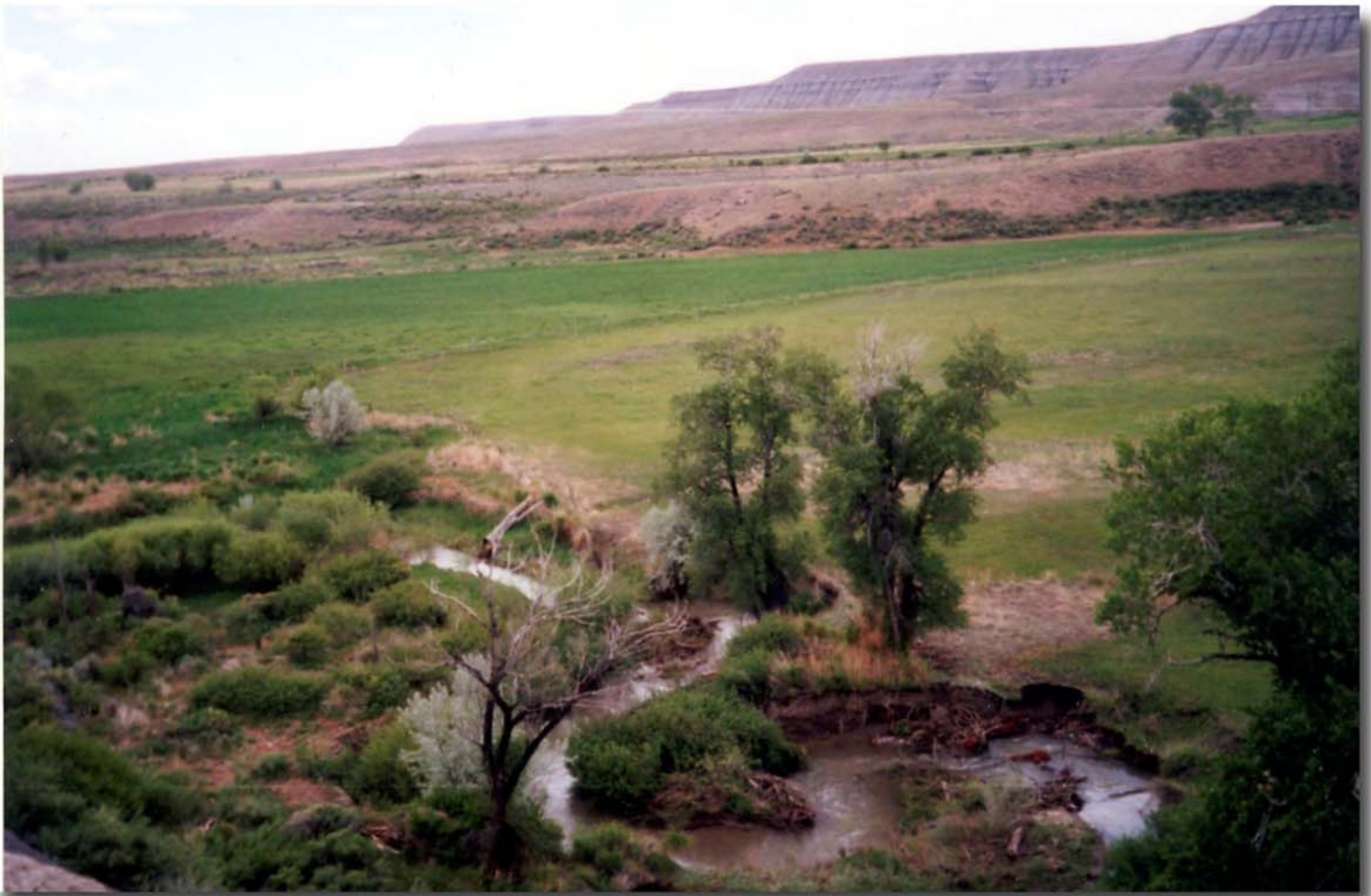
Beaver Creek and Meadows