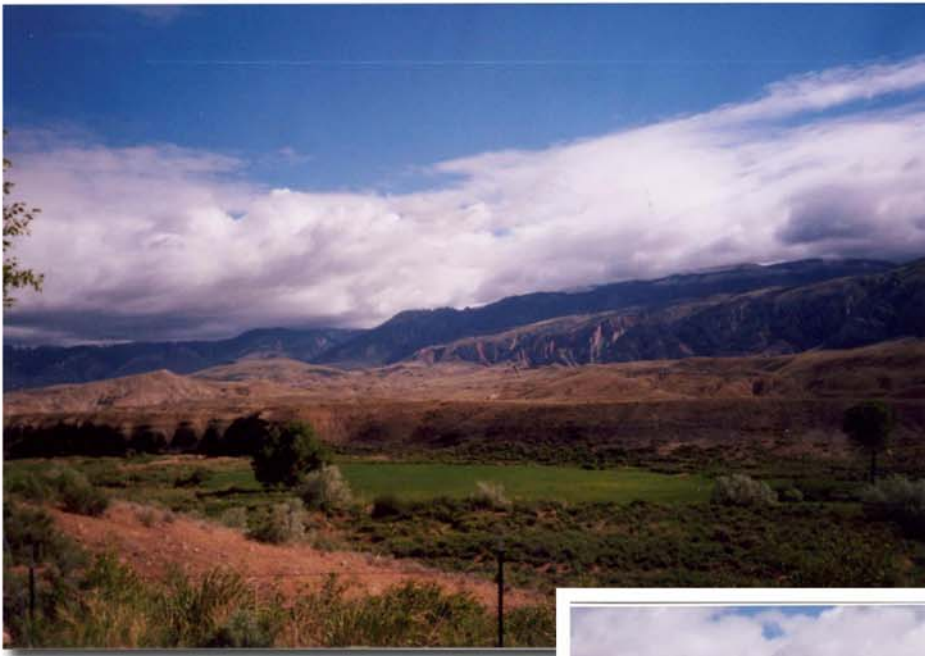
Irrigated fields Big Horn Mountains Wyoming's beautiful skies