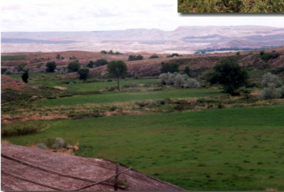
Various pastures along the creek