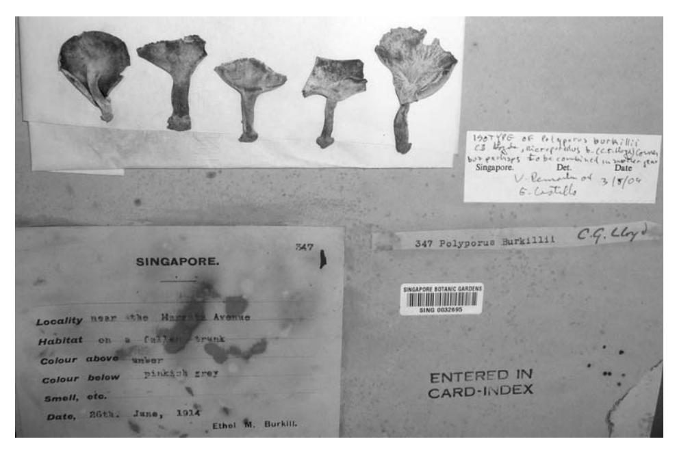
Fig. 2. Polyporus burkilliae , isotype collection (SING 32695). For enlargement of the two left-hand fruitbodies, see Fig. 3.

CZECH MYCOLOGY 64(1): 43-53, JULY 2, 2012 (ONLINE VERSION, ISSN 1805-1421)