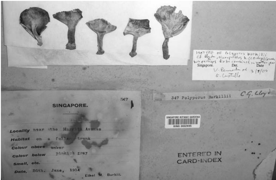
Fig. 2. Polyporus burkilliae , isotype collection (SING 32695). For enlargement of the two left-hand fruitbodies, see Fig. 3.