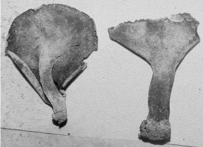
Fig. 3. Polyporus burkilliae , enlargement of the two left-hand fruitbodies of the isotype collection (SING 32695). For the whole collection, see Fig. 2.